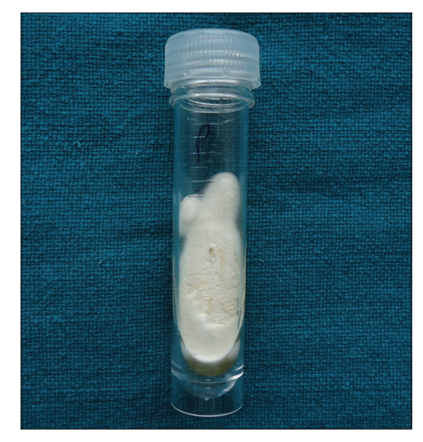
Figure 2: Colony of Trichophyton mentagrophytes

inoculation of specimens, culture conditions, severity, type and stage of disease and the effect of antifungal agents. Trichophyton mentagrophytes, grown in 91 (37.9%) cases was the most common isolate in our study [Figures 2 and 3] as also noted by Sahai and Mishra<sup>[3]</sup> On the other hand, a study conducted in 2008 in our geographical area by Jain et al.<sup>[5]</sup> found that Trichophyton rubrum was the most common dermatophyte. In our study, T. rubrum was grown in 82 (34.2%), Trichophyton violaceum in 27 (11.3%), Trichophyton tonsurans in 20 (8.3%), Microsporum audouinii in 15 (6.2%), Microsporum canis in 4 (1.7%), and Trichophyton vertucosum in 1 (0.4%) case. T. mentagrophytes was most common isolate in tinea corporis, tinea capitis and onychomycosis while T. rubrum was most common in tinea corporis with cruris.