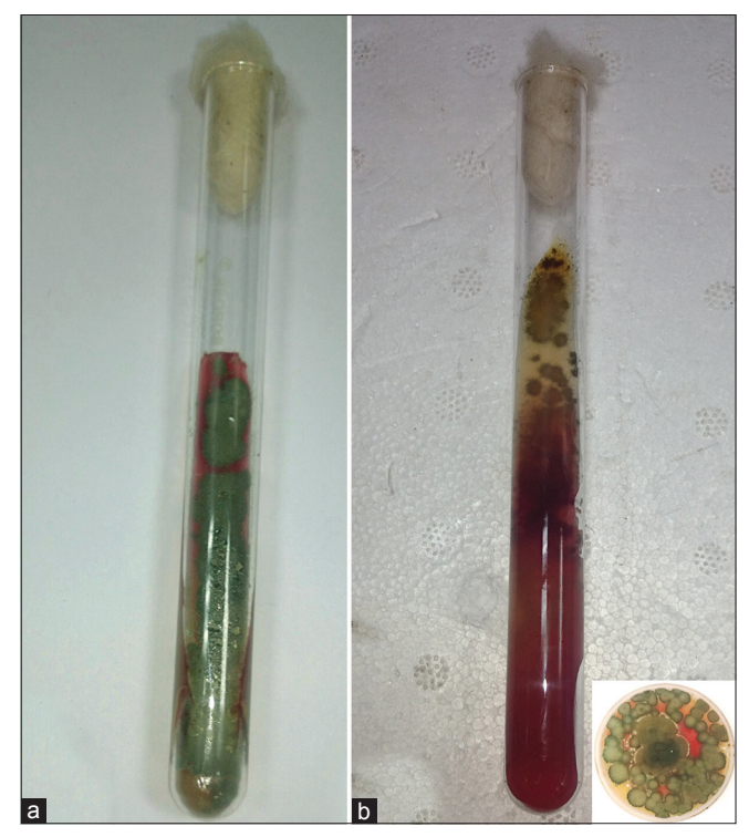
Figure 4: (a) Culture in Sabouraud's dextrose agar at 22°C showing green velvety colonies. (b) Red pigment diffusion and inset showing similar findings in petri dish culture

and hepatosplenomegaly. However, our patient had no systemic involvement clinically or with investigations. The cutaneous manifestations of this fungus are molluscum contagiosum like lesions, acniform papules, necrotic papules, and mucosal ulcers, none of which were seen in our patient. The lack of cutaneous and systemic involvement and only nail involvement by this fungus in an AIDS patient with low CD4 count on combined antiretrovital therapy is the unique feature of this case. Moreover, this fungus is not endemic in our state. Our patient has also not been in any area where this fungus is endemic. However, cutaneous and systemic Talaromyces infection has been reported in AIDS patients with