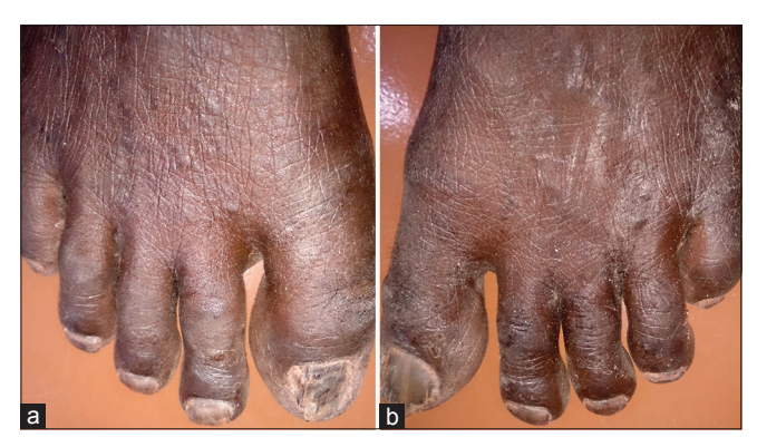
Figure 3: (a) Total dystrophic onychomycosis of the big and little toes of left foot. (b) Total dystrophic onychomycosis of the big and little toes of right foot