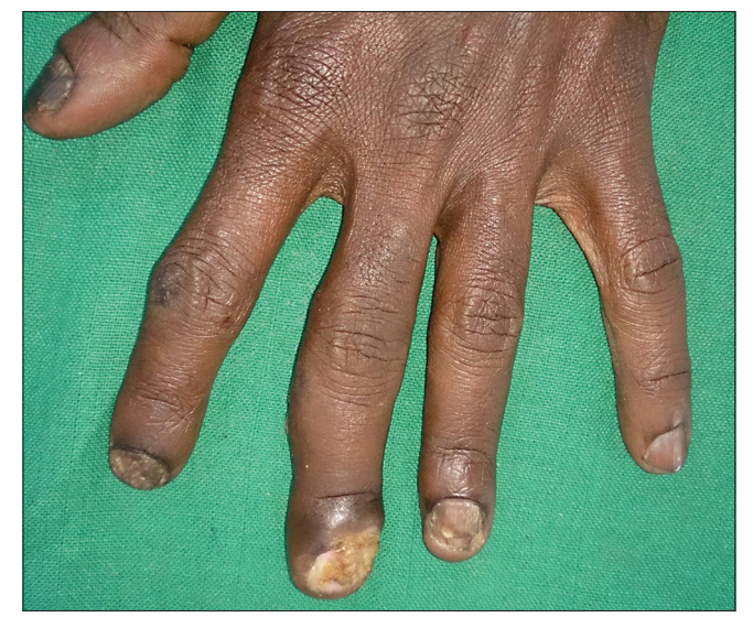
Figure 1: Total dystrophic onychomycosis of the finger nails

T marneffei: Talaromyces marneffei, SDA: Sabouraud's dextrose agar