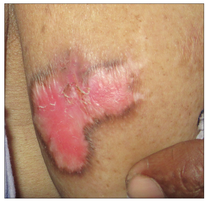
Figure 2: Indurated plaque on the left breast, with perilesional hyperpigmentation

Based on clinical and histopathological findings, the patient was diagnosed to have linear discoid lupus erythematosus with dissemination. She was prescribed oral prednisolone 1 mg/kg/day and topical clobetasol propionate to be applied once daily on the lesions, except on the breast and inguinal region. We prescribed topical tacrolimus for those areas. After ophthalmological examination, hydroxychloroquine (6.5 mg/kg/day) was started. The patient was followed up monthly with gradual tapering of oral prednisolone over 2 months, along with periodic ophthalmological checkup. Topical steroid was discontinued after 1 month, but