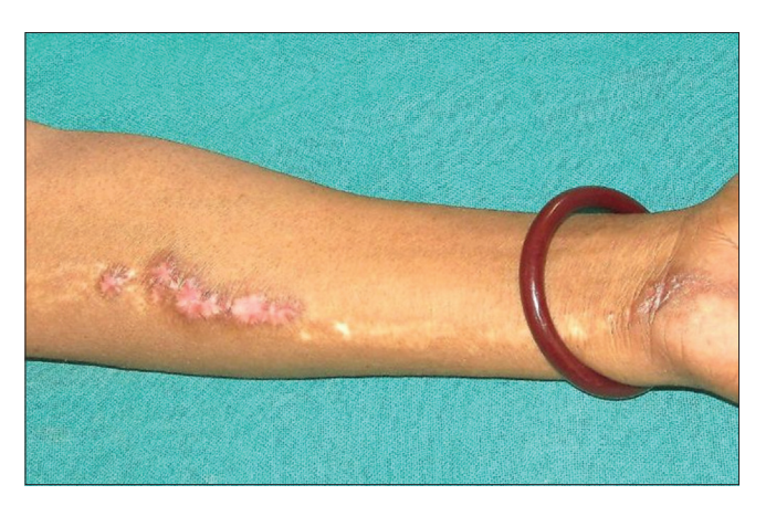
Figure 1: Erythematous indurated scaly plaques along the line of Blaschko on the inner aspect of the left forearm and palm