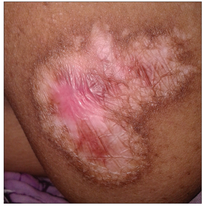
Figure 6: Residual atrophic lesion on the left breast following treatment

Abhijit Saha, Joly Seth<sup>1</sup>, Swetalina Pradhan<sup>2</sup>, Somsuvra Dattaroy<sup>3</sup>