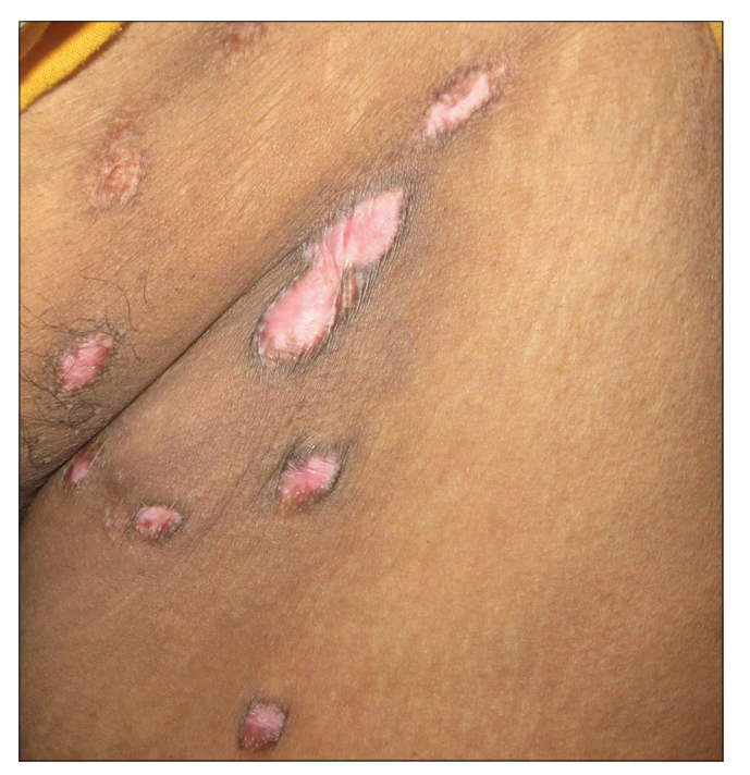
Figure 3: Atrophic and depigmented lesions on the inguinal region

Histopathology of the biopsy specimen, both from the plaque on the chest and the linear lesion on the forearm showed hyperkeratosis, epidermal thinning, foci of hydropic degeneration of the basal cell layer and dense perivascular and periappendageal mononuclear cell infiltrate [Figure 4]. Direct immunofluorescence could not be done due to lack of facilities.