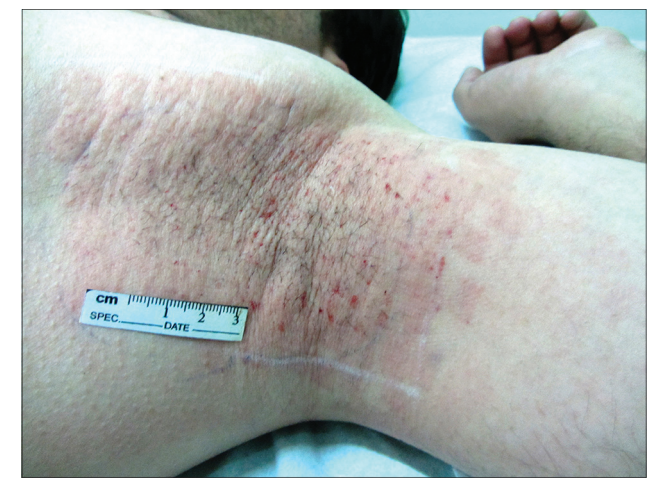
Figure 4: Erythema and pin point bleeding after FMR

interface between deep dermis and subcutis, which results in thermolysis and decrease in the size and density of the apocrine glands,<sup>[9]</sup> while minimizing damage to surrounding tissue.