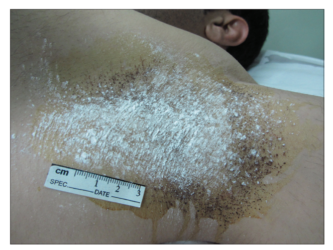
Figure 5: Starch-iodine test. Normal results of starchiodine test after four sessions of fractionated microneedle radiofrequency,(White sedimentation)

the target tissue without destroying the epidermis, by using rapid penetration with microneedle.<sup>[7,8]</sup>