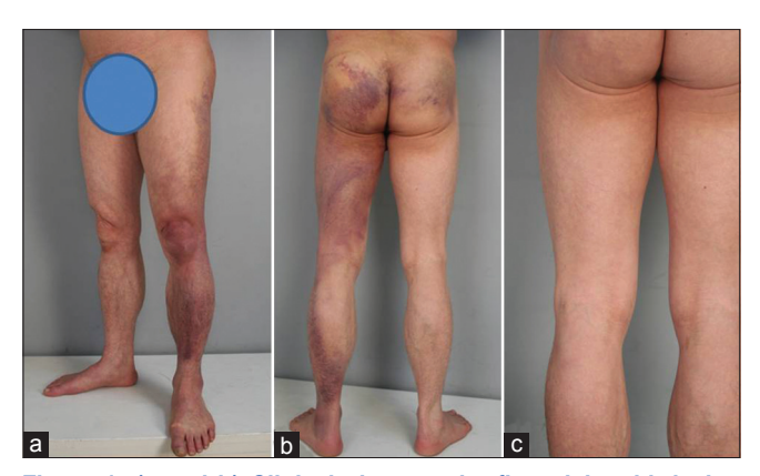
Figure 1: (a and b) Clinical photo at the first visit, with lesion showing violaceous, ecchymotic, irregular bordered patches that spread over his left limb. (c) After 4 weeks of treatment, the lesion resolved completely without any functional impairment or residual scar

Nicolau syndrome is likely not mediated by an allergic/immunologic reaction, or caused by the drug itself.<sup>[1,3]</sup>