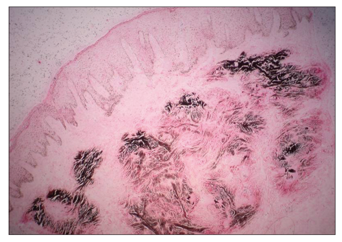
Figure 5: Von Kossa stain showing deposits of calcium in the dermis ( \times 100 )