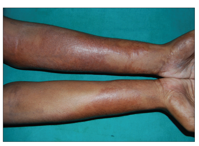
Figure 2: Forearms showing sclerodermoid changes