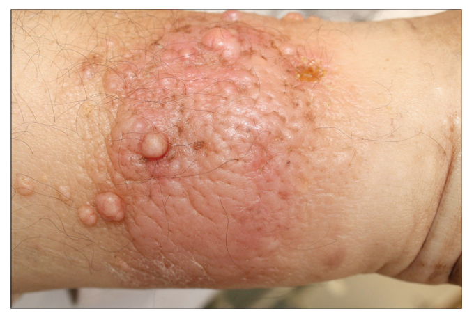
Figure 3: Posttreatment appearance

bundles by mucin.<sup>[3,4]</sup> Dermal mucin accumulation is moderate and occurs in the papillary as well as superficial reticular dermis in obesity-associated lymphedematous mucinosis. In contrast, mucin is abundant in the reticular dermis, particularly in the deeper portions, in pretibial myxedema.<sup>[3,4]</sup> The dermis in obesity-associated lymphedematous mucinosis also shows vertically running vessels, increased in number and thickness, a feature absent in pretibial myxedema. While hemosiderin deposition may occur, there is no increase in mast cells and inflammatory infiltrate in obesity-associated lymphedematous mucinosis, unlike in pretibial myxedema.<sup>[3,4]</sup> Further, dermo-epidermal splitting can be seen in obesity-associated lymphedematous mucinosis but not in pretibial myxedema with thyroid disease.<sup>[3,4]</sup>