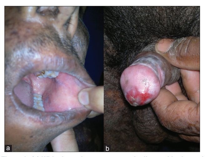
Figure 2: (a) White lacy plaques seen on the lips and in the oral cavity. (b) Whitish plaques with erosions on the glans and inner prepuce

Lichen planus has a worldwide distribution, with the overall prevalence believed to be around 1% of the adult population. It is an idiopathic inflammatory disease of the skin and mucous membranes, characterized by pruritic, violaceous papules that favor the extremities. Various clinical variants of lichen planus includes acute eruptive, hypertrophic, atrophic, bullous, actinic and oral. Although lichen planus has been mentioned in the standard textbooks of dermatology as a cause of erythroderma, one hardly encounters such presentation in clinical