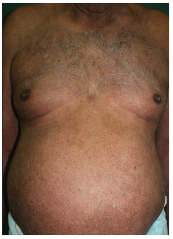
Figure 2: Complete clearance 6 weeks after starting infliximab

In conclusion, the management of obese patients with psoriasis can be challenging. Conventional systemic therapy and