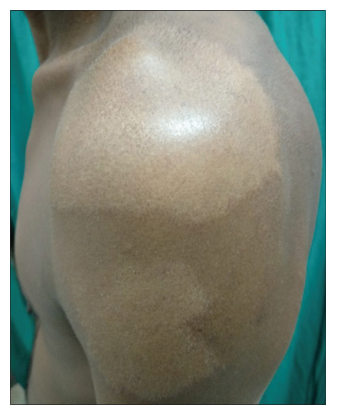
Figure 1c: Hypopigmented macules in borderline tuberculoid leprosy