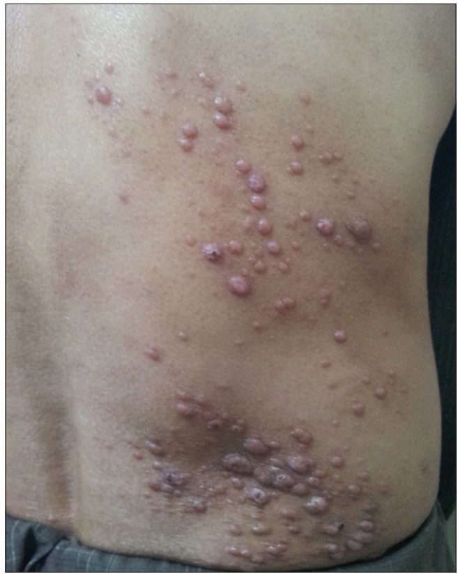
Figure 1b: Dome-shaped shiny papules and nodules in histoid leprosy