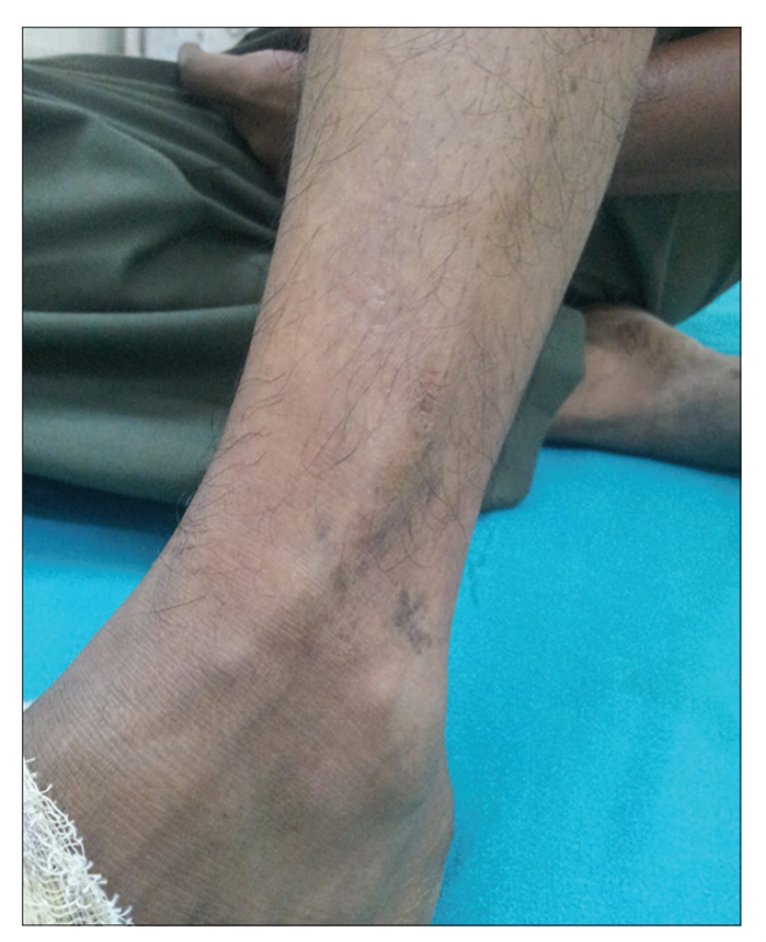
Figure 1d: Enlarged superficial peroneal nerve in pure neuritic leprosy