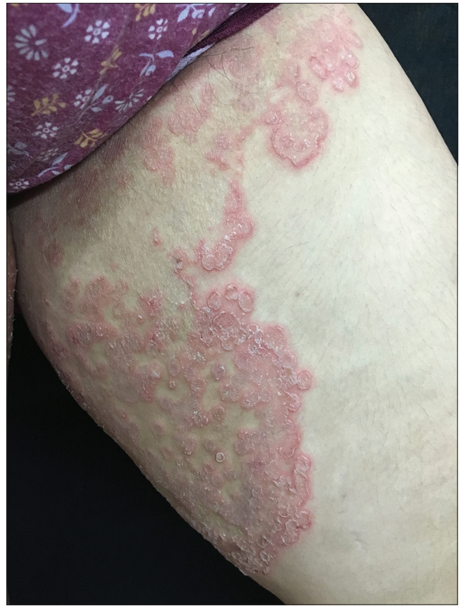
Figure 3a: Multiple annular lesions coalescing to form a plaque