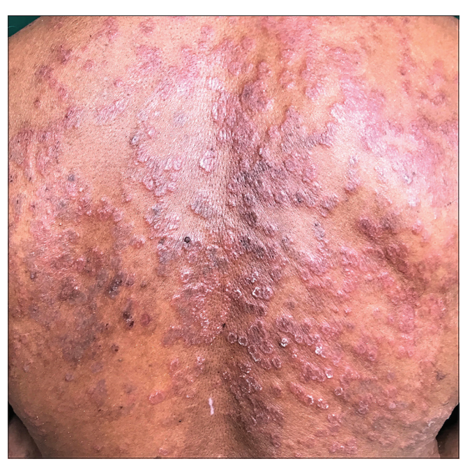
Figure 1b: Multiple annular erythematous plaques of tinea with peripheral pustular borders suggestive of severe inflammation