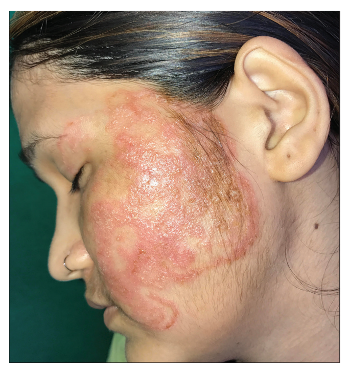
Figure 6a: Eczematous variant of tinea facei