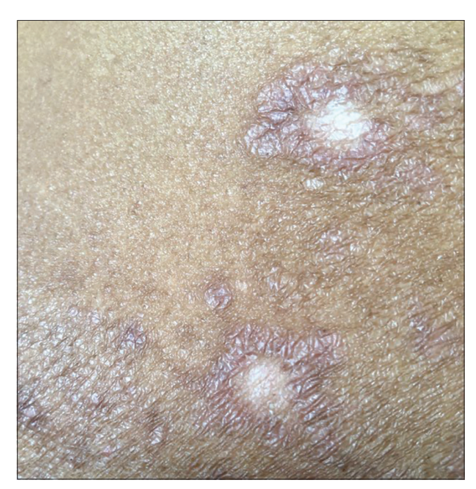
Figure 26b: Close-up of depigmentation at the site of intralesional injection

Though dermatophytosis in the current context does not spare any socioeconomic group, it is a common observation that chronic widespread dermatophytosis often affects those from the lower socioeconomic strata of society. A majority of these patients have multiple, similarly afflicted household