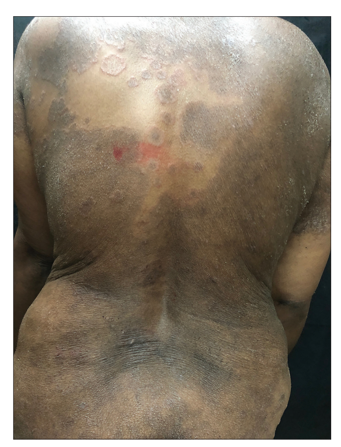
Figure 5b: Erythrodermic variant of superficial dermatophytosis

The involvement of multiple body sites is common. Tinea corporis et cruris is the most common presentation;<sup>3</sup> individual