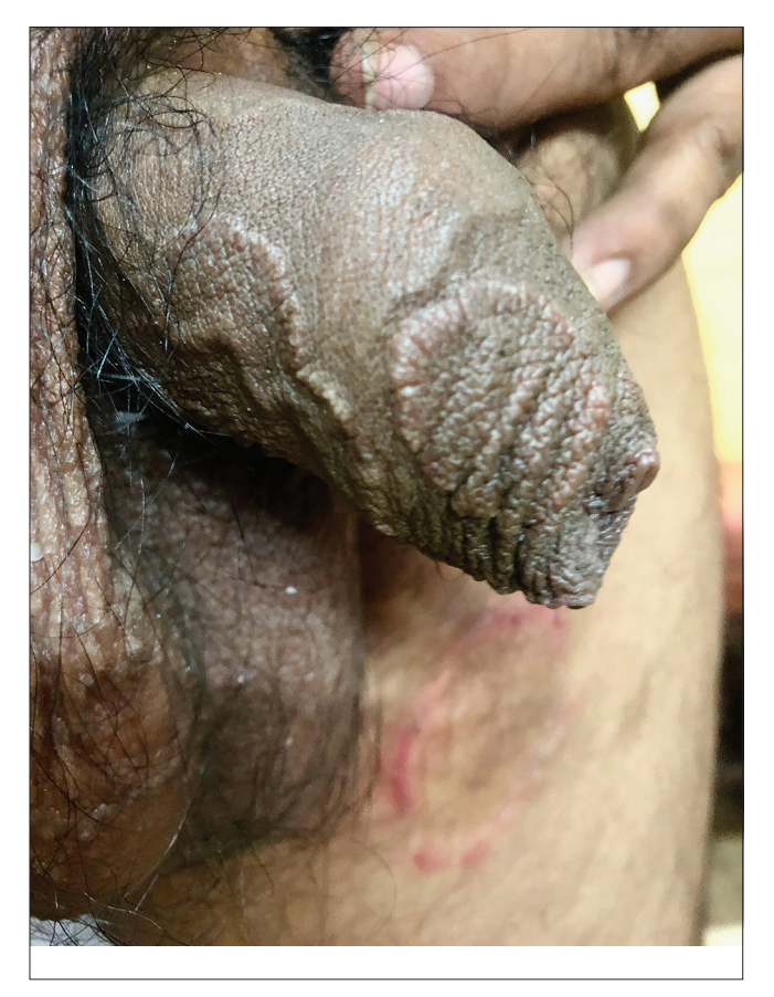
Figure 15: Tinea cruris with male genital dermatophytosis manifesting as well-defined annular plaques