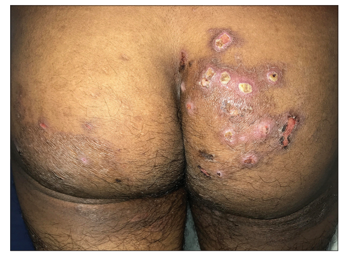
Figure 27: Superficial dermatophytosis with superadded bacterial infection

contacts, resulting in a magnification of the financial burden of treatment. Such patients usually start with self-treatment and are later advised inappropriate medication (including steroid-containing creams) by non-dermatologists or unqualified individuals. The treatment continues with little or no benefit, compelling the patient to finally visit a dermatologist. Oral antifungals like itraconazole and topical molecules like luliconazole, sertaconazole, oxiconazole, amorolfine and ciclopirox olamine are currently preferred by dermatologists. They are perceived as more efficacious but are also much more expensive than the older antifungal drugs and are a significant financial burden to the patient, especially when multiple family members are affected. Cheaper brands manufactured by companies with uncertain credentials may lack efficacy, necessitating multiple visits to dermatologists and adding