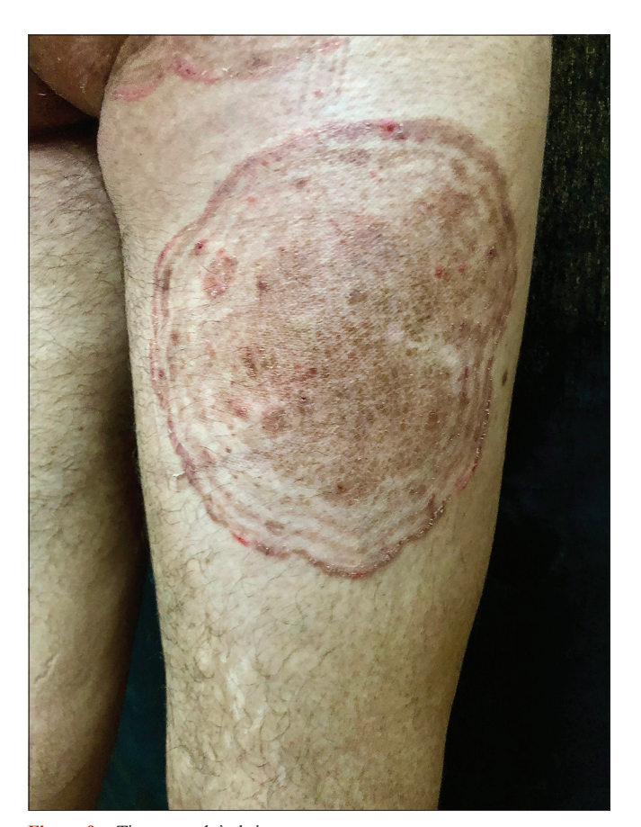
Figure 9a: Tinea pesudoimbricata