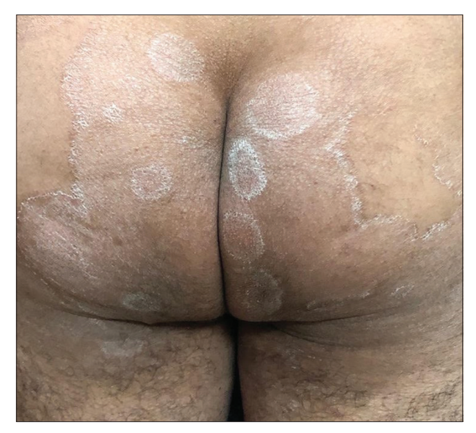
Figure 1a: Annular plaques of tinea corporis with minimal inflammation