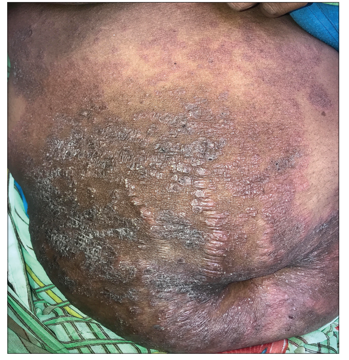
Figure 6b: Eczematous variant of tinea corporis

tinea corporis and tinea cruris are the next two commonest. Lesions at sites of occlusion like the waist and inframammary areas are frequent in female patients [Figure 13a,b].