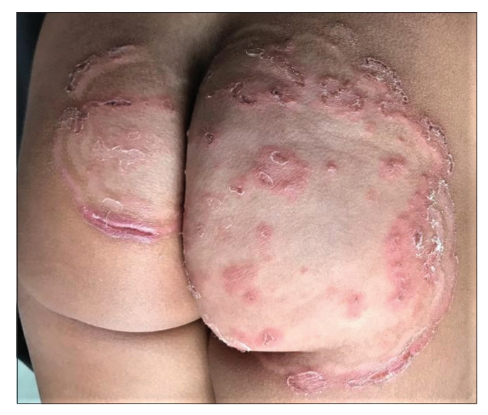
Figure 8b: Steroid modified tinea with pseudoporokeratotic edges

An interesting observation is the absence of a proportionate increase in tinea unguium, tinea pedis and tinea capitis.<sup>5</sup>