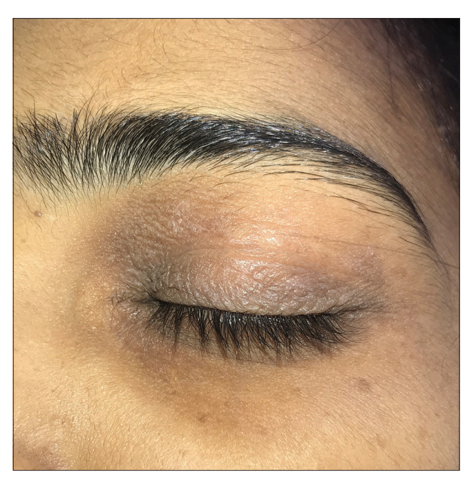
Figure 21a: Superficial dermatophytosis of the upper eyelid with involvement of the eyelid margin

Stopping steroid creams and instituting appropriate antifungal therapy is recommended in these patients. In our observation of a limited number of cases, the serum cortisol levels then return to normal within 3 to 5 months.