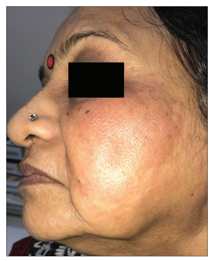
Figure 2b: Sudden appearance of erythema and edema overlying a plaque of tinea faciei after starting antifungal therapy

Erratic application of fixed-dose combinations and steroid creams in tinea switches inflammation on and off, leading to "double-edged" tinea [Figure 7 ].<sup>42</sup> The degree of inflammation in such cases often is high, and residual post-inflammatory hyperpigmented "double edges" persist for a long time after successful treatment too [Figure 7]. At times, the double edges are well-defined, running parallel to each other and with central crusting and erosions, resulting in a pseudoporokeratotic appearance [Figure 8a and b]. Repeated on-and-off cycles of inflammation for long periods can lead to concentric rings of tinea described as "tinea"