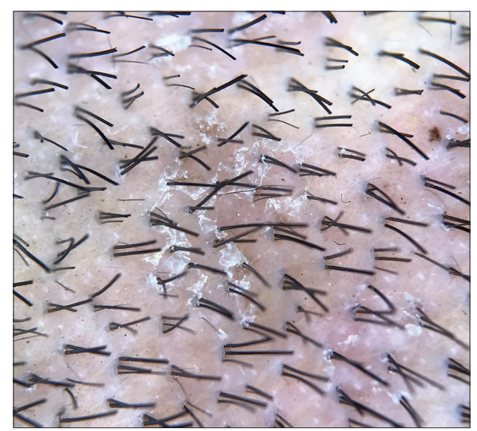
Figure 17b: Dermatoscopy of scalp skin dermatophytosis—manifesting as fine scaling. Dermlite DL4N, polarized mode x10

phenomenon, tinea labialis. It is rare and presents as a well-circumscribed scaly lesion or as diffuse scaling over the entire lip.<sup>56</sup>