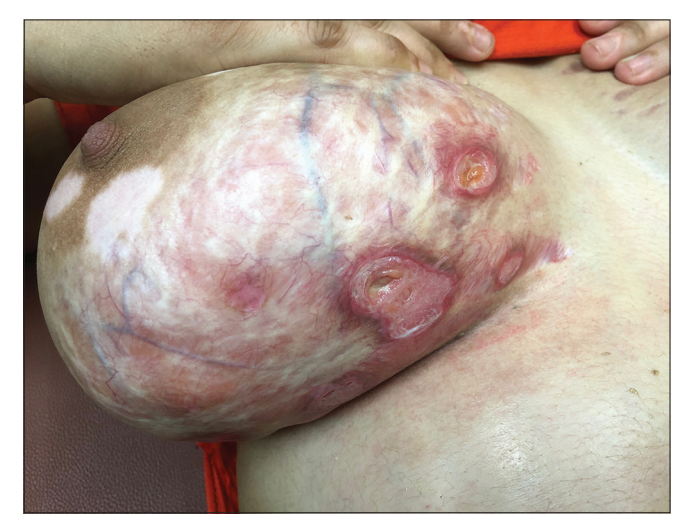
Figure 24: Steroid abuse in dermatophytosis leading to hypopigmentation, striae, atrophy, telangiectasia and ulceration

can be very bothersome for adults and children alike. Patients complain of paroxysms of pruritus lasting for a few minutes a few times a day; some have it for longer periods. Another common symptom is 'burning and itching." In many cases, it gets aggravated by sweating, heat, hot water and after disrobing (atmokinesis), and can disturb sleep. A significant number of patients complain of nocturnal exacerbation of pruritus. Some fully treated patients complain of persistent itching which is often due to xerosis or impaired barrier function due to scratching and topical corticosteroid abuse. Topical antifungal agents like luliconazole have been anecdotally observed by many dermatologists to cause xerosis which can contribute to itching.