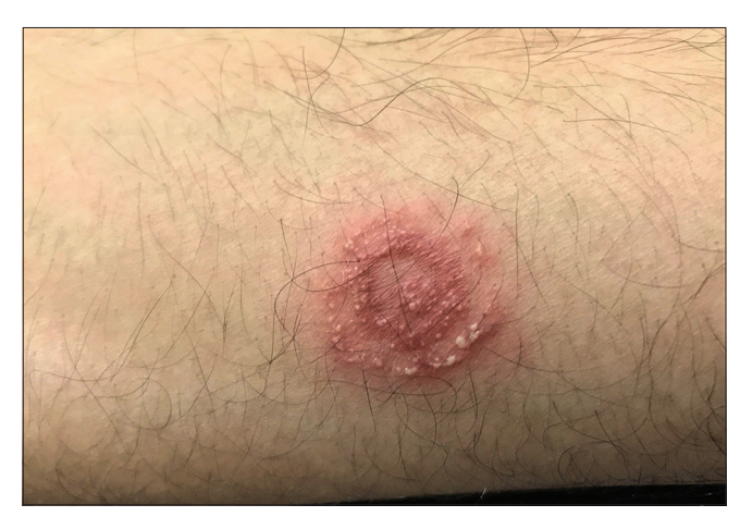
Figure 11: Cockade pattern of pustular lesions in steroid-modified tinea

or tinea cruris et corporis, and the vast majority of these patients have a history of applying fixed-dose combinations