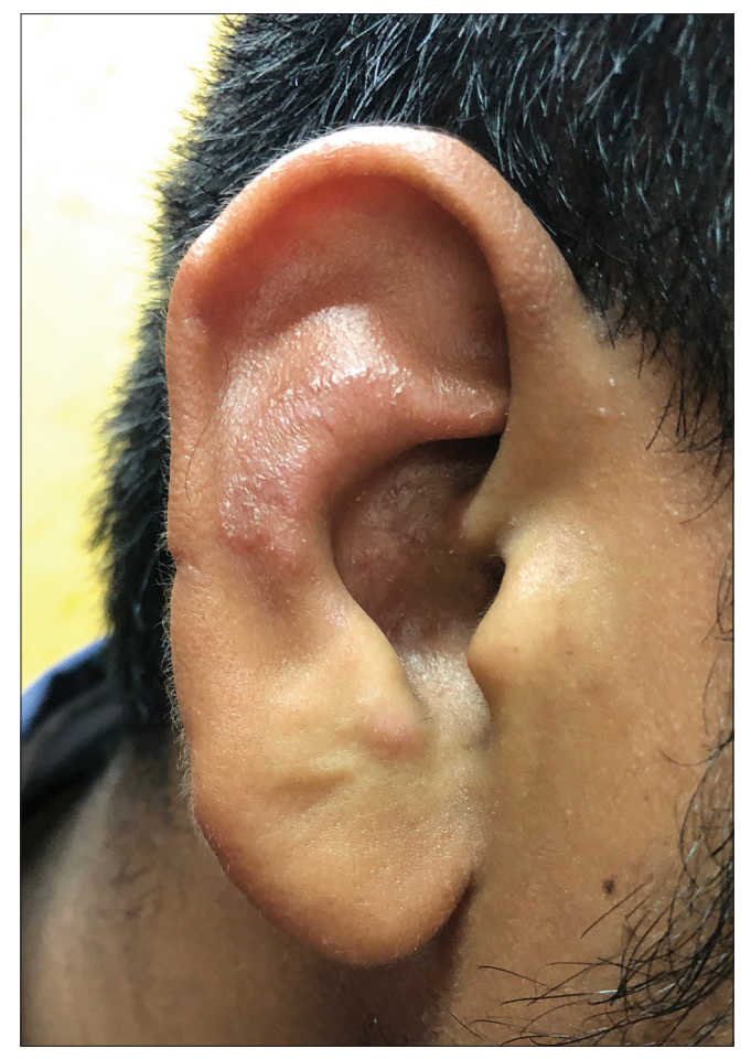
Figure 19b: Tinea auricularis

despite the patient having stopped applying fixed-dose combinations. This is indicative of high potency topical steroids having adepot effect.<sup>69</sup>