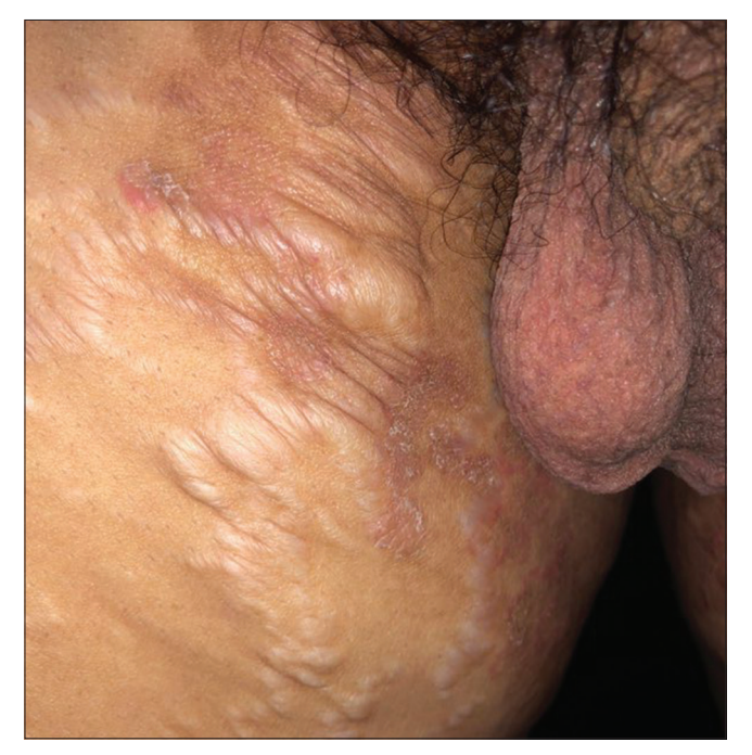
Figure 25: Pseudoedematous appearance of striae