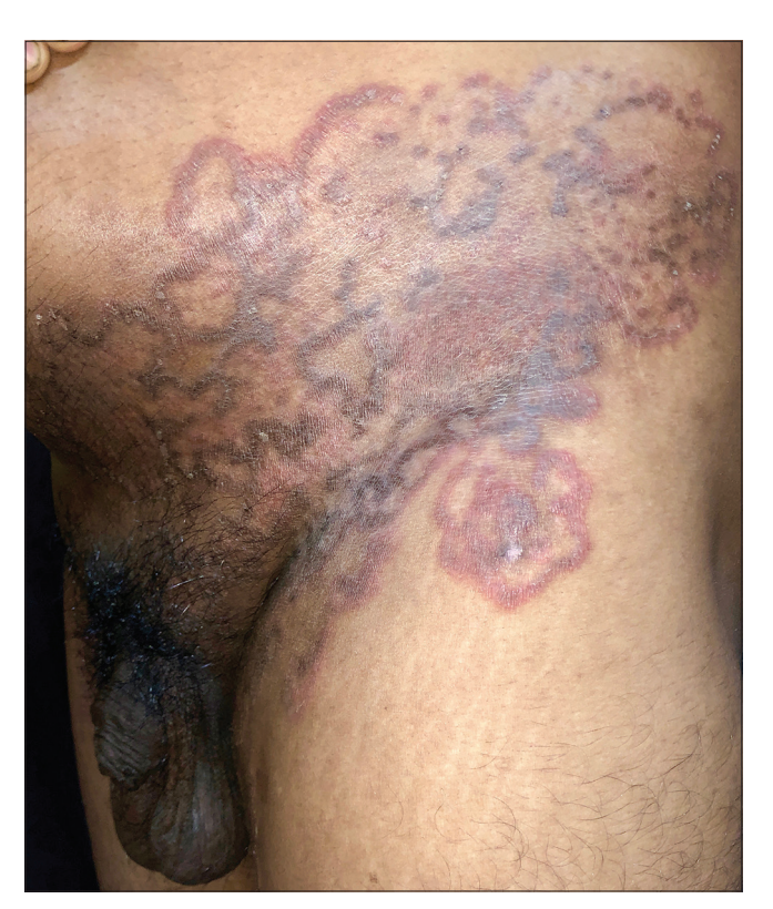
Figure 3b: Multiple annular lesions coalescing to form a plaque