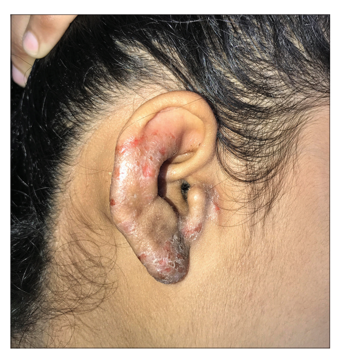
Figure 19a: Tinea auricularis

ulcerate because patients continue to apply the same creams that caused them. Some striae assume a pseudoedematous appearance [Figure 25].<sup>68</sup> Others may continue to grow