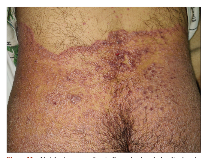
Figure 23a: Vesicles in a case of varicella predominantly localized to the site of tinea corporis that serves as an immunocompromised district

some patients needing treatment for 6–9 months before the infection finally resolved.