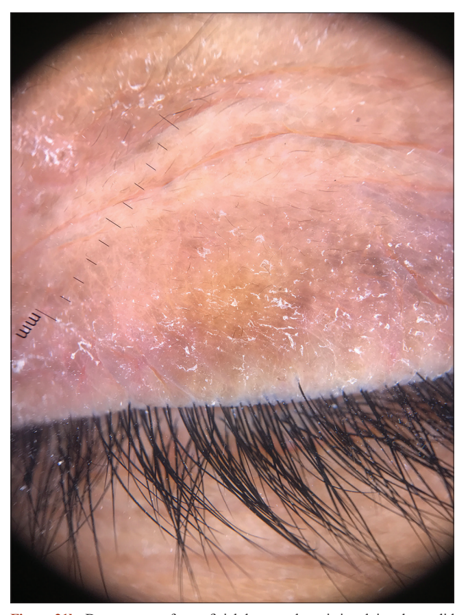
Figure 21b: Dermoscopy of superficial dermatophytosis involving the eyelid margin presenting with fine scaling along the eyelid margin sparing the hair shafts

The infection in such cases may take a much longer time to fully clear despite appropriate treatment.<sup>71</sup> We have had