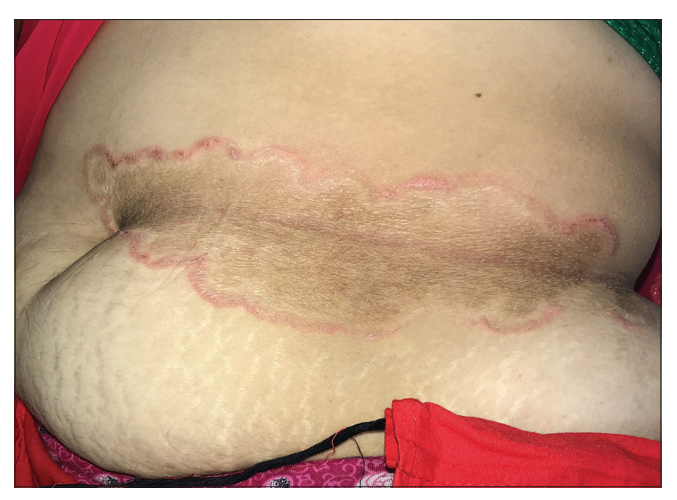
Figure 13b: Tinea corporis presenting as a large annular plaque limited to the area of waistline along the line of occlusion by drawstring