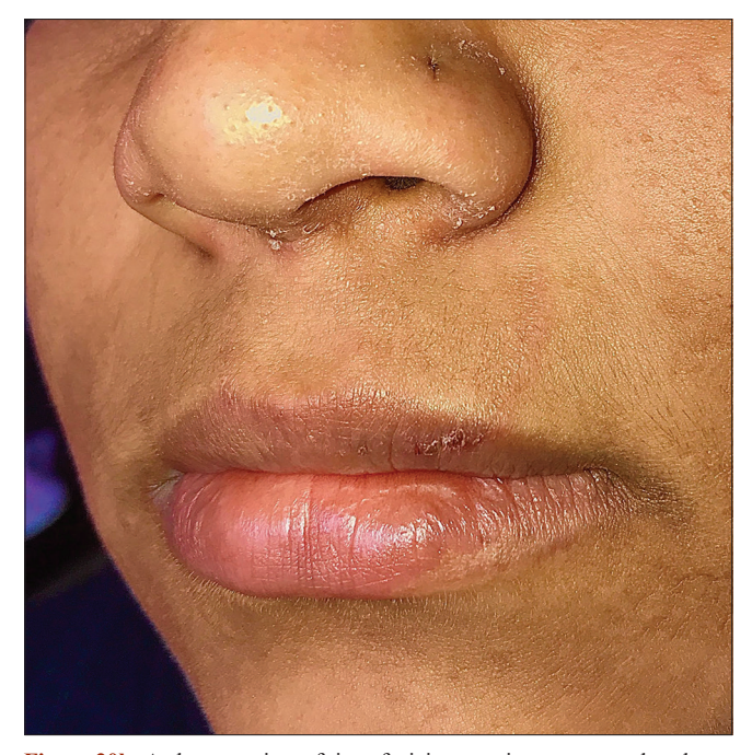
Figure 20b: A close-up view of tinea faciei presenting as an annular plaque with extension to the upper lip