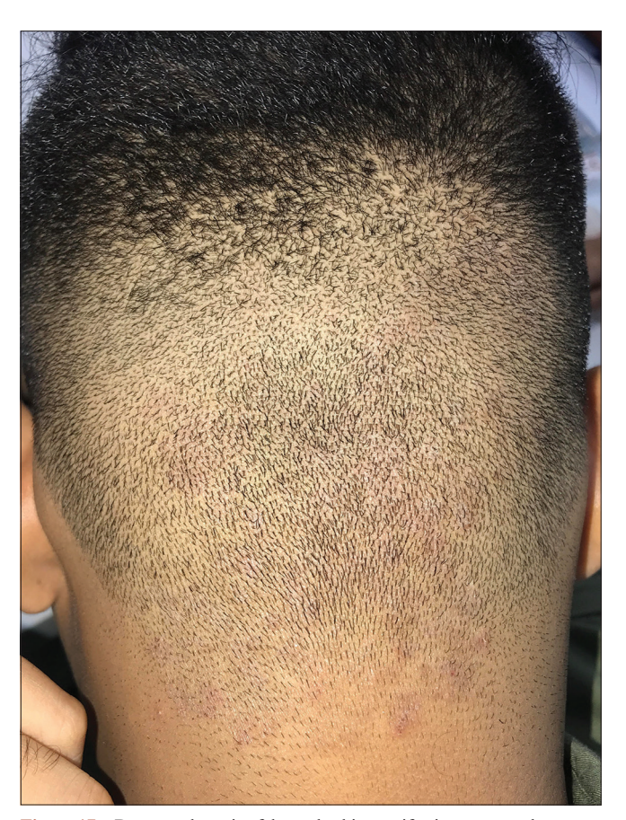
Figure 17a: Dermatophytosis of the scalp skin manifesting as an erythematous scaly, ill-defined plaque on the occipital area

presentation [Figure 19a and b].<sup>56</sup> c. Tinea facei extending onto the lips and tinea labialis: Lip involvement can occur due to contiguous spread from tinea faciei [Figure 20 a-c] or as an isolated