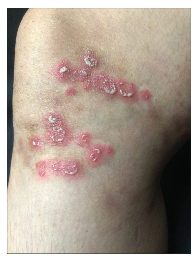
Figure 4: Multiple coalescing lesions with pustules