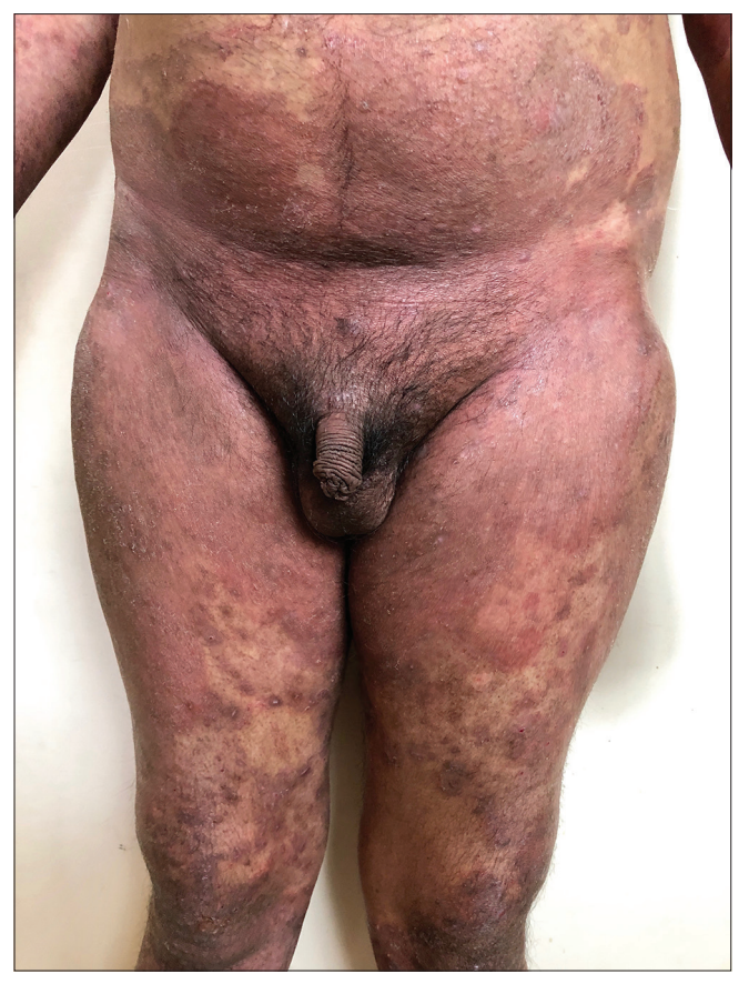
Figure 5a: Erythrodermic variant of superficial dermatophytosis