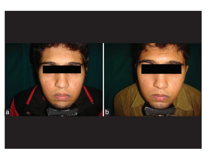
Figure 4: Patient, observer-1, and observer-2 agreed good (50-75%) improvement (a) before treatment (b) after treatment