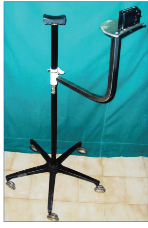
Figure 1: The instrument used for taking consistent photographs

(60%) and 10 females (40%). They belonged to the age group of 18-38 years. The duration of scars ranged from as less as 6 months to 15 years. Most patients had grade 4 acne scars constituting 48% (12 cases) of the