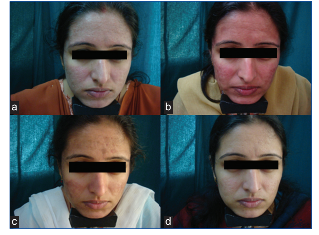
Figure 5: Sequence of events post-laser treatment: (a) Immediate post laser, (b) 1 day post laser, (c) 3 days post laser, (d) 7 days post laser