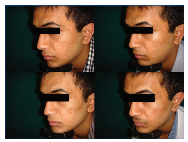
Figure 2: Digital photographs after first, second, third, and fourth sittings