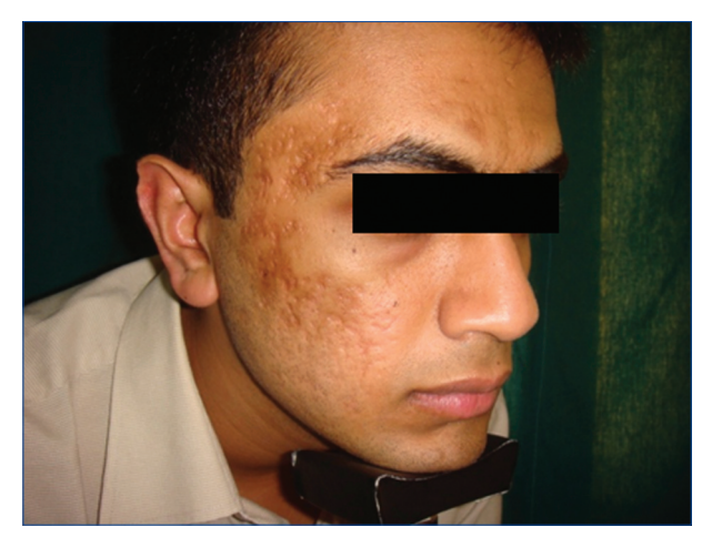
Figure 6: Post-inflammatory hyper pigmentation

Ninety-six percent of the subjects rated themselves as having at least fair improvement. Rolling and superficial box scars showed higher significant improvement when compared to ice pick and deep box scars. Patient's satisfaction of improvement was higher when compared to physician's observations and it increased markedly after third sitting. Incidence