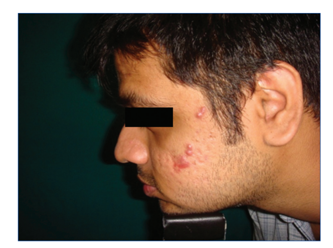
Figure 7: Exacerbation of acne lesions

Indian Journal of Dermatology, Venereology, and Leprology | March-April 2013 | Vol 79 | Issue 2