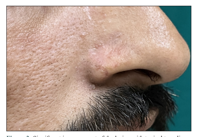
Figure 3: Significant improvement of the lesion with topical tacrolimus at 8 weeks.

porokeratosis of Mibelli related to actinic damage and is most commonly distributed over the nose and the perinasal region. Hence, it is known by other names, such as solar facial porokeratosis, localised actinic nasal porokeratosis, and localised actinic facial porokeratosis.<sup>3</sup> The lesions are difficult to treat. The choice of treatment depends on the number, site, and size of the lesions. Ablative or surgical modalities like laser ablation, cryotherapy, dermabrasion, surgical excision, photodynamic therapy, and electrodessication are the preferred treatments of choice for solitary or localised lesions. For disseminated lesions, medical modalities, systemic retinoids, and phototherapy have been tried.1 For a localised bur large-sized lesion or lesion located at an unresectable site, various topical modalities including 5 fluorouracil, corticosteroids, retinoids, keratolytic agents, vitamin D3 analogues, 5% imiquimod, and 3% diclofenac sodium, have been tried with varying success rates. Facial porokeratosis is unique for its location. There is not much