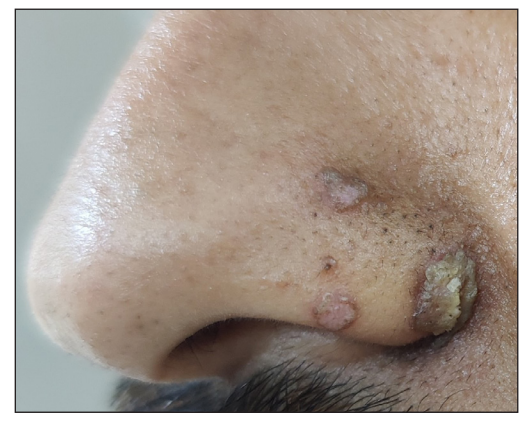
Figure 1b: Three well-defined erythematous annular keratotic plaques with central atrophy and raised borders and thick yellowish heaped-up crust over the left ala.

How to cite this article: Kumar S, Patra S, Nalwa A. Focal actinic porokeratosis over nose successfully treated with topical tacrolimus. Indian J Dermatol Venereol Leprol. doi: 10.25259/IJDVL_880_2023