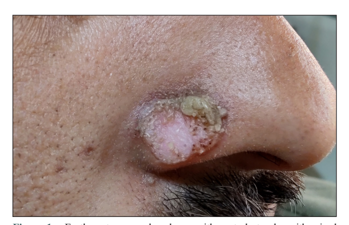
Figure 1a: Erythematous annular plaque with central atrophy with raised borders over the right ala.

Porokeratosis refers to a heterogeneous group of disorders but it retains the morphology of annular plaques across the spectrum. The extremities, trunk, and sometimes the flexors are the common sites. Facial lesions are seen concomitantly in a small percentage of DSAP patients but isolated facial porokeratosis is rare.<sup>2</sup> It is considered as a distinct subset of