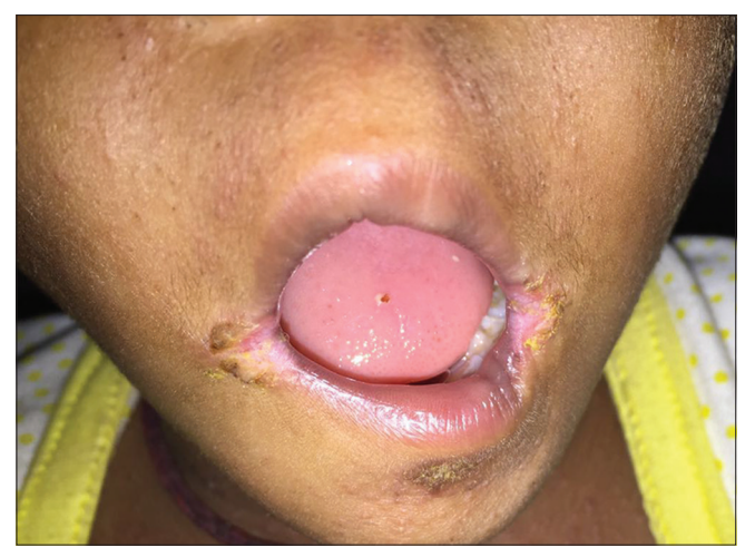
Figure 2: Yellowish keratotic lesions on the angles of the mouth