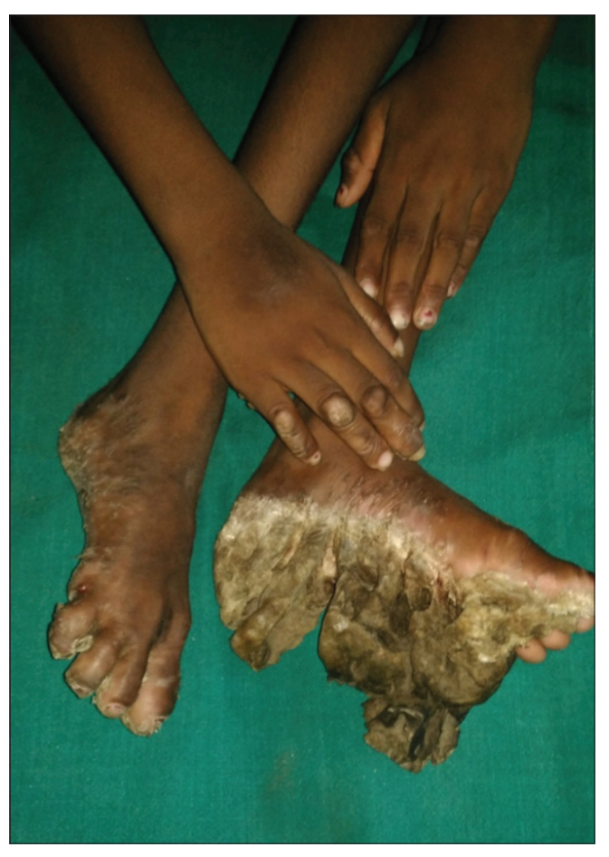
Figure 1: Painful, massive, hyperkeratotic plaques resulting in flexion deformities of digits and loss of toe

H.C. Olmsted first described this syndrome in the year 1927 in a 5-year-old boy. It is a rare congenital condition characterized by the development of periorificial keratotic plaques and bilateral palmoplantar transgradient keratoderma, which are the two characteristic signs that distinguishes it from other keratodermas including Mal de Meleda and Vohwinkel syndrome. It is usually seen