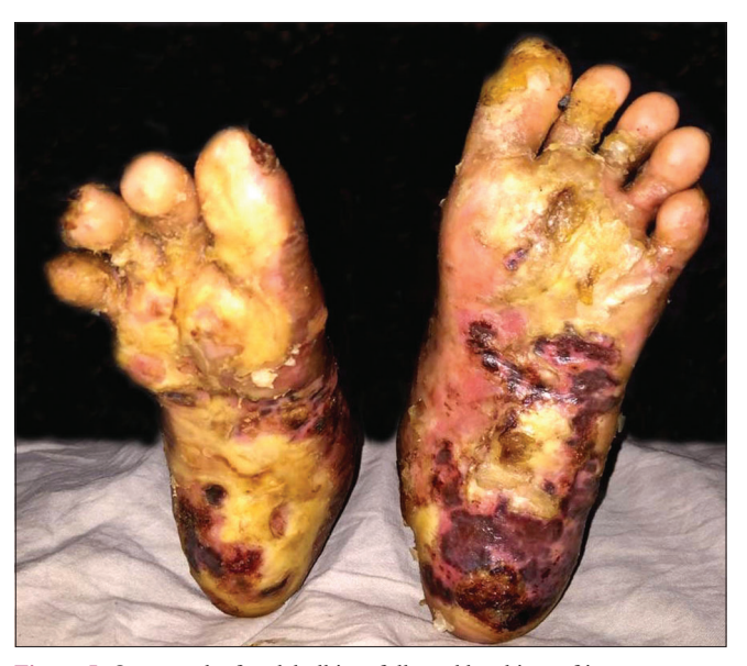
Figure 5: One month after debulking, followed by skin grafting

around right little toe (pseudoainhum) followed by the loss of the finger. Similar lesions were also found in her two twin sisters. There were no abnormalities of the nails, hair, oral mucosa, teeth or joints. All these findings were consistent with Olmsted syndrome.