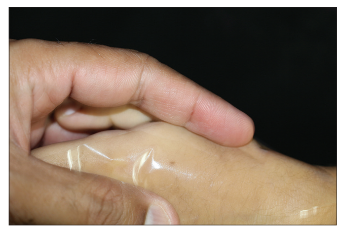
Figure 1: Application of wide transparent adhesive tape over the lesion after applying contact fluid