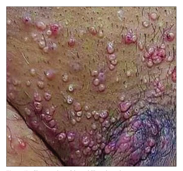
Figure 1b: Close-up view of the umbilicated papules