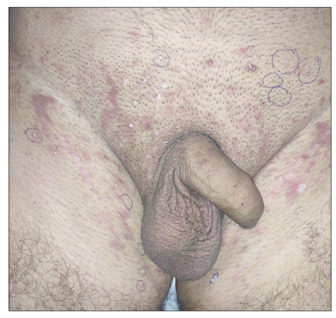
Figure 2a: Molluscum contagiosum overlying sites of resolved dermatophytosis along with striae rubra

tumors or immune reactions. It is a sectorial defect in immune control having deficient or increased dysfunctional immune cells. Chronic lymph stasis, radiation, trauma and herpetic infection are factors responsible for local immune dysregulation.2 On literature search, we found only one case series describing varicella and herpes zoster over tinea corporis.<sup>3</sup> Amongst the non-infective dermatoses, only lichen planus has been reported to occur over healed tinea corporis.<sup>4</sup> T cell exhaustion or dampened T cell response has been noted under conditions of antigen persistence in numerous infections.<sup>5</sup> This can lead to the involved area becoming an immunocompromised district. Verma et al. suggested the possibility of exhaustion of cutaneous lymphocyte antigen positive T cells in regions affected by dermatophytosis.3 Cell mediated immune response is essential for the control and elimination of molluscum contagiosum. Thus, deficient