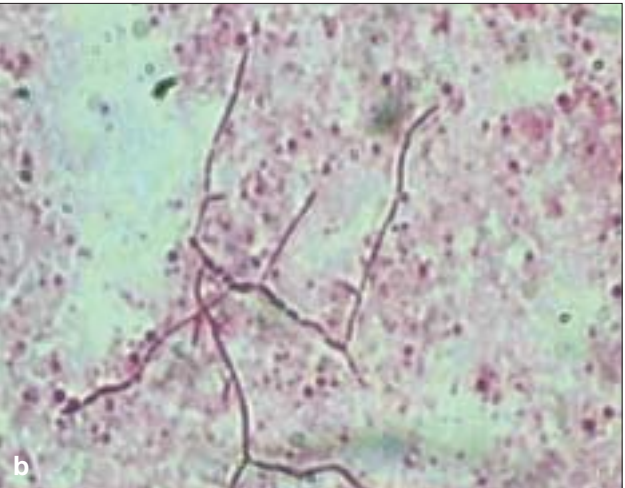
Figure 3: (a) Culture on blood agar showing growth of characteristic tiny, irregular, chalky white colonies. (b) Fine, branching, filamentous bacilli breaking into coccoid forms (Gram's stain, ×100)