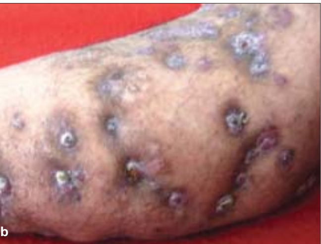
Figure 1: (a) Case 1: Mycetoma due to Nocardia brasiliensis (b) Case 2: Mycetoma of leg (calf region)