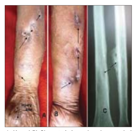
Figure 4: (A and B) Characteristic puckered, crusted, draining sinuses arranged in sporotrichoid pattern over dorsal hand and anterior-posterior aspect of forearm along the lateral border (arrows). (C) Osteolytic and sclerotic changes in underlying radius and ulna are also seen (arrows)

and routine investigations, including chest x-ray, were normal. X-ray films of the involved leg showed soft tissue swelling suggestive of thickened overlying skin, exudate collection in fascial planes, and normal underlying bones. Repeated microscopic examination of pus in KOH mounts showed typical vermiform granules with lobulated edges [Figure 2B]. Histopathology revealed mildly acanthotic epidermis, epithelioid cell granulomas with minimal caseation necrosis,a few Langhan's giant cells in the middermis, and no fungus in PAS-stained sections. Aerobic culture of the biopsy material yielded small chalky white colonies on blood agar at 35°C after 96 hours, identified to be of Nocardia spp. from gram-positive, weakly acid fast branching filamentous bacilli. Treatment with co-trimoxazole