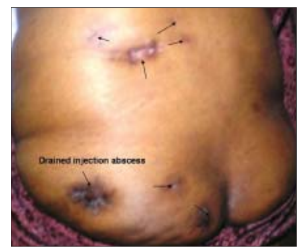
Figure 5: Puckered, crusted, draining sinuses arranged in sporotrichoid pattern over right gluteal region, while secondary lesions (arrows) are arranged in lymphocutaneous pattern along lumbosacral and paravertebral area

(sulfamethoxazole 800 mg + trimethoprim 160 mg / b.i.d.) and dapsone (100 mg/d) resulted in complete healing of all lesions with puckered scarring in a year.