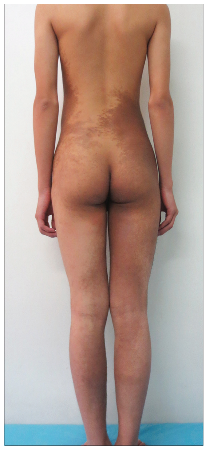
Figure 1b: Multiple light to dark-brown patches in different size involving the lower back, buttocks, and posteromedial sides of lower limbs

Becker's nevus usually manifests as a solitary lesion that predominantly involves the upper trunk, scapular region, or upper arm unilaterally.<sup>1</sup> Though multiple Becker's nevi have