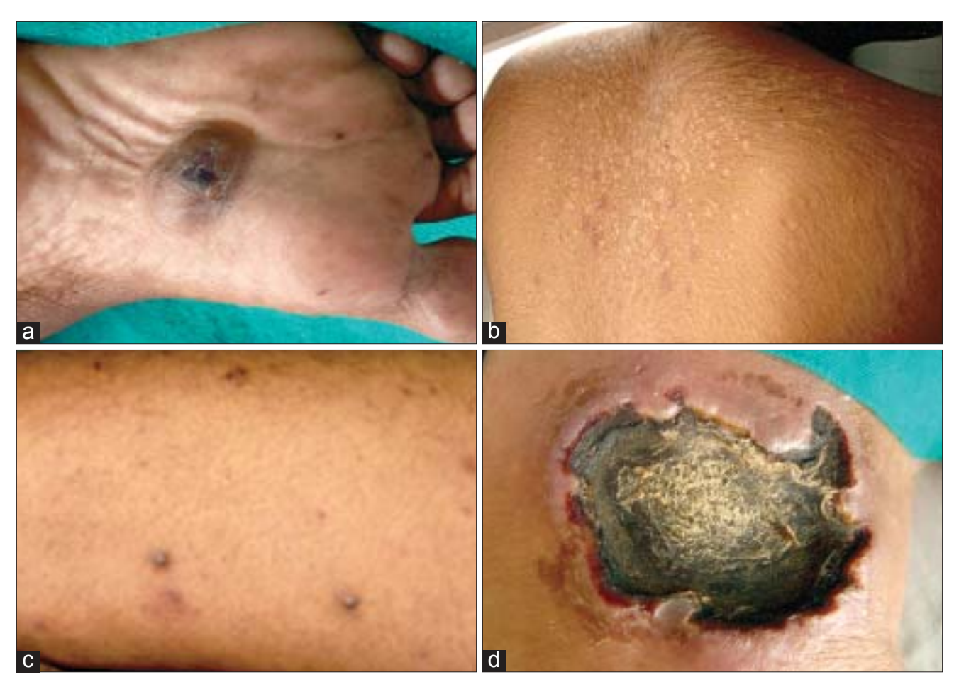
Figure 2: Rare Lesions in RTR. (a) Phaeomycotic cyst, (b) Persistent nodules at the site of intradermal hepatitis B vaccination with tinea versicolor, (c) Acquired perforating dermatosis, (d) Vasculitis associated with antiphospholipid antibody syndrom

The incidence of viral infections (29%) is similar to data by Chugh et\ al^{2} (21%), while studies from Italy (Bencini et\ al^{-}\ 35\%)^{[6]} and United States (Koranda et\ al^{-}\ 43\%)^{[9]} have shown a higher prevalence. In our study, viral warts were the predominant lesion (62%) and included both verruca vulgaris and verruca plana.