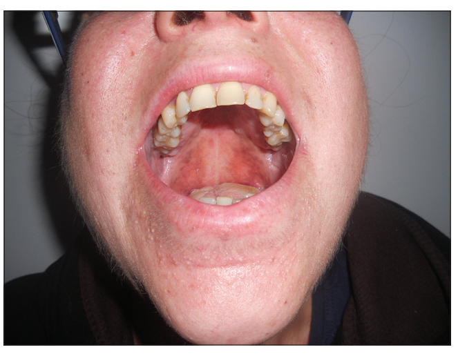
Figure 3b: Complete resolution of the oral-perioral blisters and cheilitis picture after zinc replacement