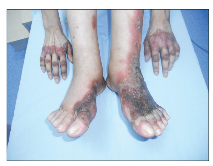
Figure 1a: Eczematous plaques located bilaterally on the dorsal surfaces of the hands and feet extending to the pretibial area.

infectious gastroenteritis. Two weeks after her recovery from diarrhea, her dermatological complaints had appeared. The patient had a history of sleeve gastrectomy 4 years ago. She is a social drinker and a 20 pack-year smoker. The patient lost 46 kg after sleeve gastrectomy which is 48% of her preoperative weight. She was also on follow up for epilepsy since a year. On cutaneous examination, irregular-edged, sharply demarcated, erythematous, scaly, hemorrhagic crusted, eczematous plaques,