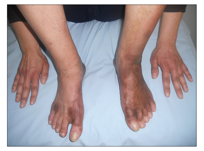
Figure 3a: Complete resolution of the acral eczematous lesions with postinflammatory hyperpigmentation after zinc replacement therapy