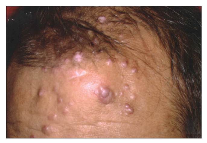
Figure 1: A single 6 × 6 cm oval subcutaneous swelling over left side of forehead, at baseline. Overlying and adjacent scalp shows numerous 0.5 to 1.5 cm-sized erythematous papules and nodules

Angiolymphoid hyperplasia with eosinophilia was first described by Wells and Whimster in 1969 and despite