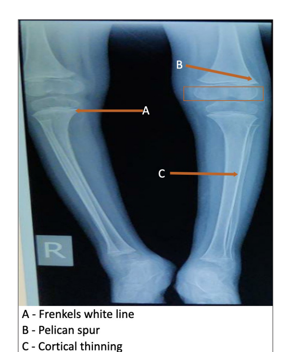
Figure 2: Radiograph of knee joint