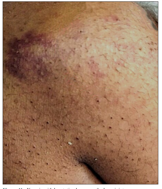
Figure 1b: Xerosis with keratotic plugs over the knee joint

How to cite this article: Dhurat RS, Sharma R, Pai SU, Zatakia SM. Scurvy-Once a common condition likely to be missed in these uncommon times! Indian J Dermatol Venereol Leprol doi: 10.25259/IJDVL_400_2023