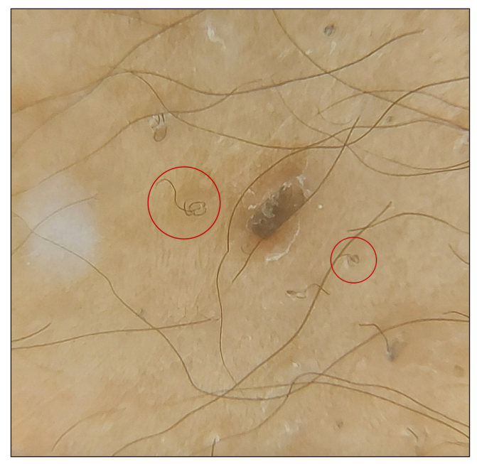
Figure 3a: Dermoscopy showing coiled hair

Scurvy is a multiorgan systemic disease because of diversefunctions of vitamin C. The occurrence of scurvy in children with autism or other neuropsychiatric disorders is not uncommon.\(^1\) Additionally, the high-risk groups include children with iron load due to multiple blood transfusions, anorexia nervosa, celiac disease, Crohn's disease, haemodialysis and other causes of a restricted diet.\(^1\) A few dermatological signs, which are seen in the early stages, are follicular hyperkeratosis and coiled corkscrew hair.\(^2\) Broken and lustreless hair are due to abnormal disulfide bonding and keratin formation.\(^3\) Fragile blood vessels resulting from impaired collagen synthesis give rise to perifollicular haemorrhages, petechiae and ecchymoses.\(^2\) Rarely, we may see nail splinter haemorrhages and alopecia.\(^3\) Serum vitamin C levels are considered specific, but laboratory tests are