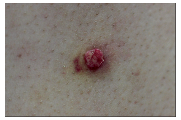
Figure 1: A solitary, 0.8 cm-sized, erythematous to yellowish growth on the back

contagiosum virus might have been co-infected at the time of epidermal cyst formation.