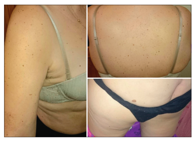
Figure 2: Multiples lentigines in patient's mother. In addition, there is a café-au-lait macule on the left lumbar area