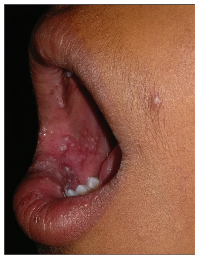
Figure 4a: Multiple, soft, flesh-colored, 2–3 mm papules extending in linear fashion from inner aspect of right lower lip to buccal mucosa