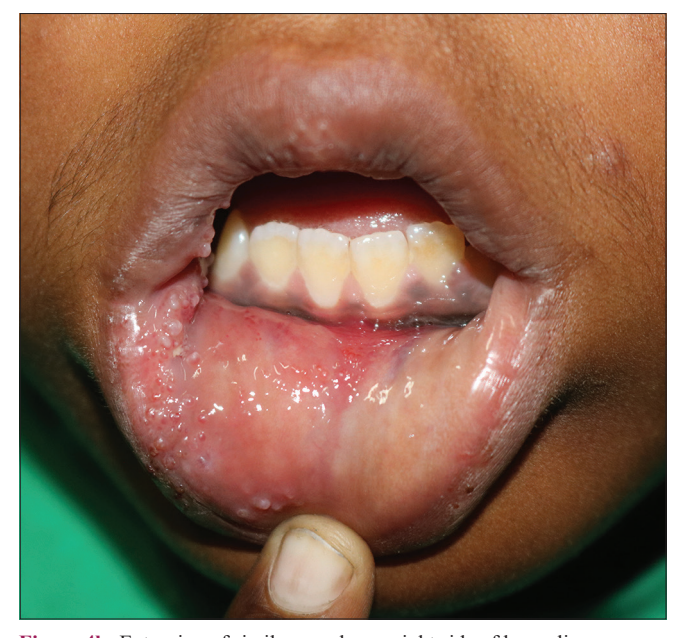
Figure 4b: Extension of similar papules on right side of lower lip