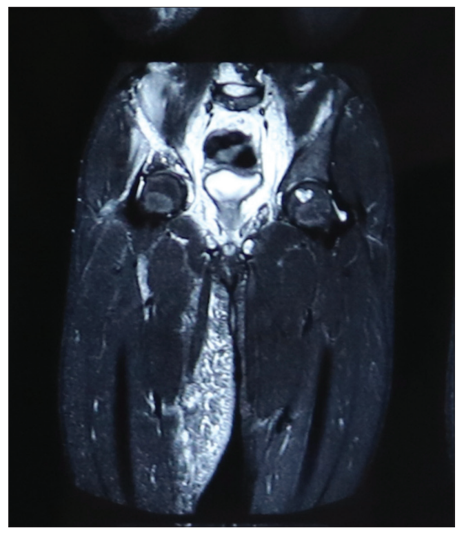
Figure 2a: Hyperintense mass lesion involving entire pelvis, including iliac (right more than left) and ischial bones

right). Magnetic resonance imaging (MRI) of the scrotum and local parts revealed diffuse multicompartmental T2 hyperintense infiltrative mass lesion with mild postcontrast enhancement involving the pelvis, ileum, ischial bones, subcutaneous and intermuscular planes, anterior (medial and lateral) aspect of bilateral thigh, and both scrotal sacs consistent with clinical diagnosis of