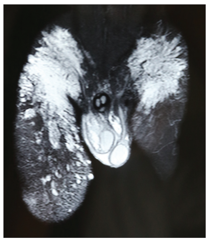
Figure 2b: Hyperintense mass lesion in scrotal sacs