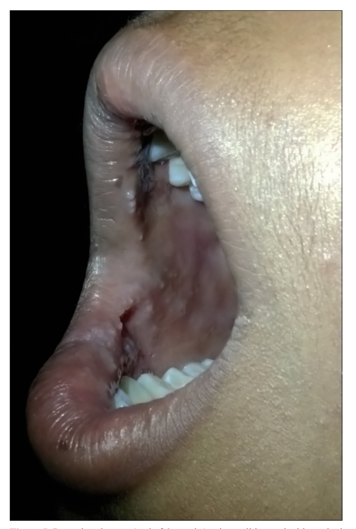
Figure 5: Postsclerotherapy (end of 6 months) using polidoconol with marked reduction in right buccal mucosa lesions

A 10-year-old boy presented for evaluation of asymptomatic lesions on the right buccal mucosa with swelling of cheek and lips on the right side since 1 year. The lesions had gradually increased to the present size, with gradual involvement of left buccal mucosa also. He had difficulty in mastication. Cutaneous examination revealed multiple, soft, flesh-colored, 2–3 mm papules extending in a linear fashion from the inner aspect of the right lower lip to the buccal mucosa, with discrete papules adjacent to the linear lesions [Figure 4a and b]. Few similar papules were seen on the left buccal mucosa. There was associated edema of the right cheek and right side of upper and lower lip. Biopsy was consistent with lymphangioma. Ultrasound showed multiple, unilocular, sub centimeter sized, noncommunicating cystic spaces in the submucosal and intramuscular planes in the right cheek, with few similar spaces also seen on the left submucosal plane. MRI lymphangiography showed abnormal T2 hyperintense lesions involving bilateral buccal mucosa with minimal postcontrast enhancement without any bony involvement. One USG-guided sclerotherapy treatment using injection