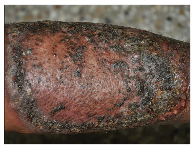
Figure 1a: Well-defined large plaque with central scarring and peripheral hyperkeratotic crust and ulceration over the left shin

Blastomycosis-like pyoderma is usually managed with systemic antibiotics. Recent reports have demonstrated the use of acitretin with good response.<sup>3</sup> Other treatment options include topical and intralesional steroid, saturated solution of potassium iodide, dapsone, cyclosporine, cryosurgery, electrodessication