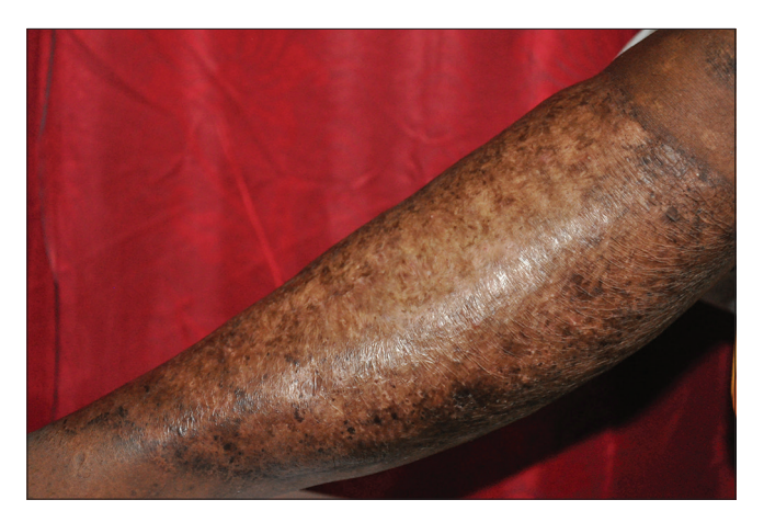
Figure 3: Resolution of lesions after 3 months of saturated solution of potassium iodide

and CO<sub>2</sub> laser ablation.<sup>4</sup> Our patient showed remarkable response with saturated solution of potassium iodide, despite the failure of all other therapeutic modalities. There was complete resolution within 3 months and she is in complete remission