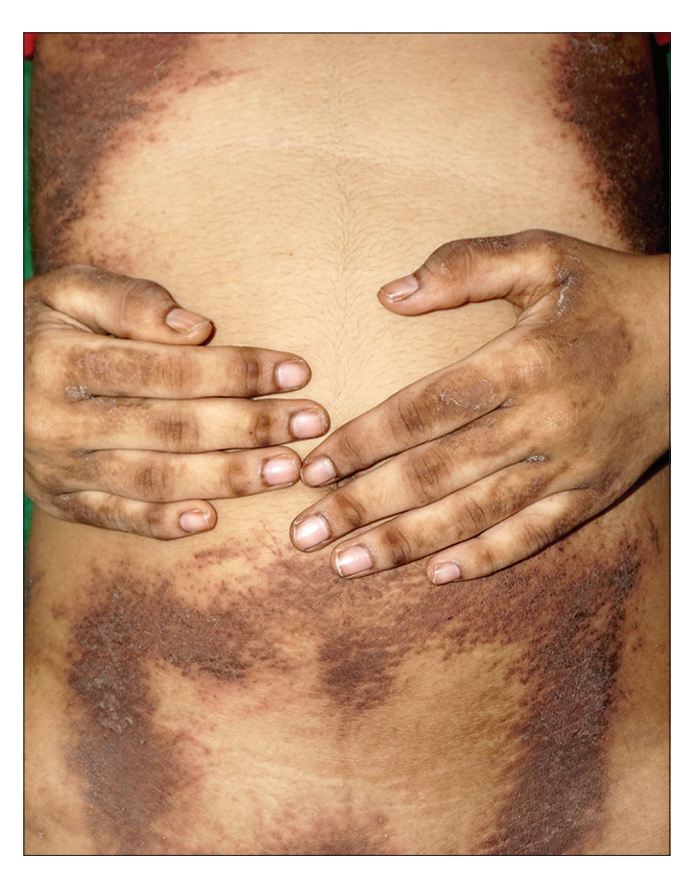
Figure 1: Blotchy hyperpigmentation and dusky erythematous plaques on abdomen and hands