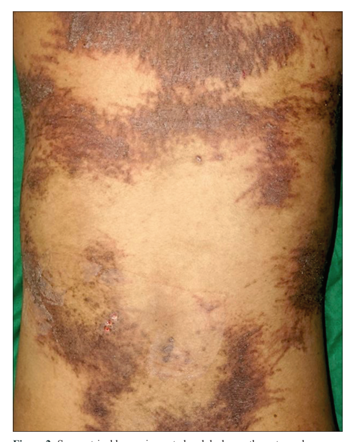
Figure 2: Symmetrical hyperpigmented and dusky erythematous plaques on back with linear streaks extending in a flagellate pattern