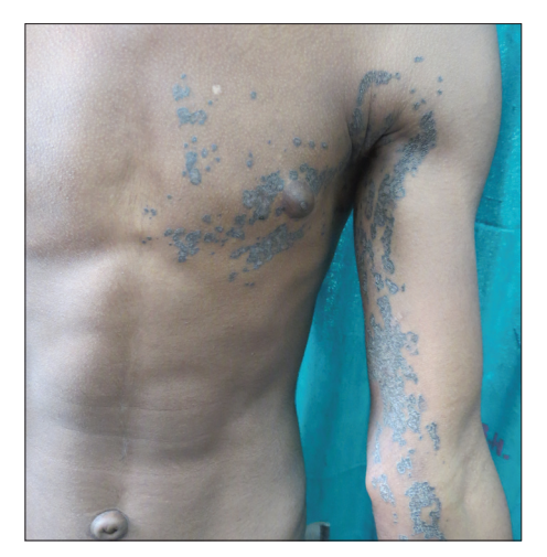
Figure 1: Porokeratosis: Hyperpigmented annular lesions distributed in a blaschkoid fashion along the left side of chest, shoulder, ventral and medial aspect of arm, and forearm