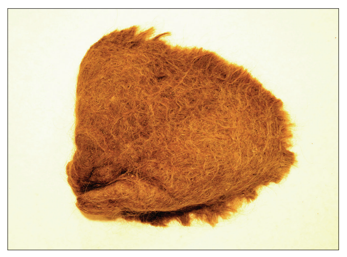
Figure 3: Plica polonica. Museum of the History of Lithuanian Medicine and Pharmacy.

In many cultures, hair plays an important role in the development of social constructs about the body. Hairstyles convey powerful messages about a person's beliefs, morality, gender roles, sexual orientation and even religion, political views and socioeconomic status.<sup>27</sup> The symbolic power of the human hair could be traced back from Biblical times: Samson, mentioned in the Book of Judges, had superhuman abilities to kill a lion, to slay an entire army or to destroy a temple with his bare hands; however, after his hair was cut off, Samson's powers were gone and he was imprisoned by the enemies.<sup>28</sup> Cutting one's hair by force symbolizes a defeat, humiliation or punishment. In Nazi Germany, forced cutting of hair represented government's control of Jews.<sup>27</sup>