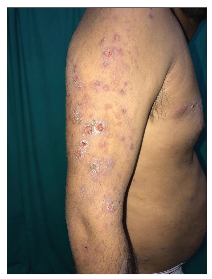
Figure 1: Necrotic erythema nodosum leprosum lesions over arm in a patient