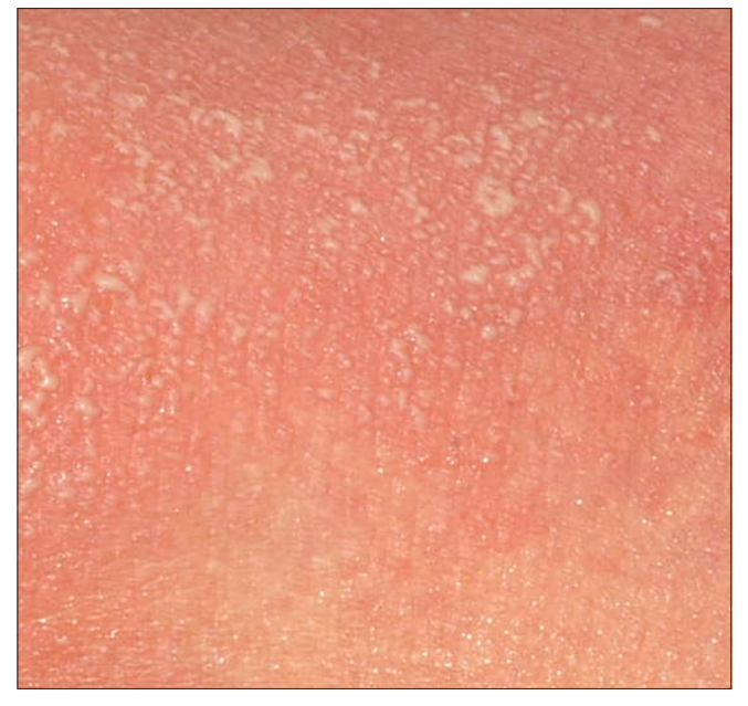
Figure 1b: AGEP induced by curcumin. Close-up view of pustules on an erythematous base