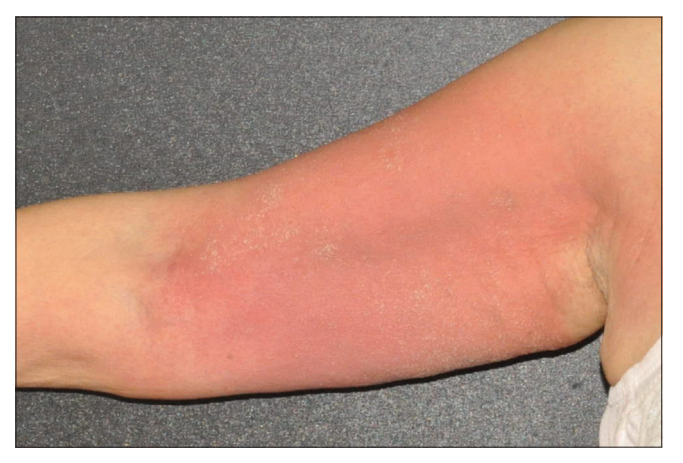
Figure 1a: AGEP induced by curcumin. Erythematous plaques with pustules formation on the right upper arm

Physical examination showed widespread erythematous and edematous plaques with many tiny non-follicular pustules on thighs, groin, bilateral upper arms and axillae [Figure 1]. Laboratory results revealed an elevated white blood cell count of 11800/µL and elevated eosinophil count of 1215/