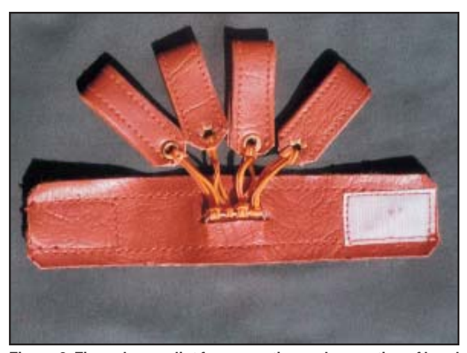
Figure 3: Finger loop splint for prevention and correction of hand deformities

We retrospectively analyzed the records of 426 leprosy patients with reactions treated using a standard steroid regimen<sup>11</sup> under field conditions. This regimen