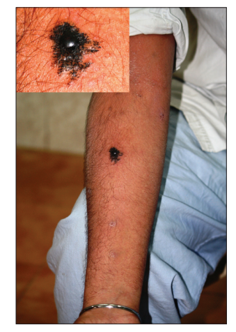
Figure 1: Bullous ecchymotic lesions over arm with close up (inset)

Examination revealed multiple tender black ecchymotic lesions some with bullae over the accessible as well as non-accessible sites on the scalp, neck, trunk and extremities [Figure 1]. These lesions were observed to subside over a period of 7-10 days with resolution in a bruise like manner with post inflammatory hyperpigmentation. He was observed as an admitted patient to rule out dermatitis artefacta. Although some