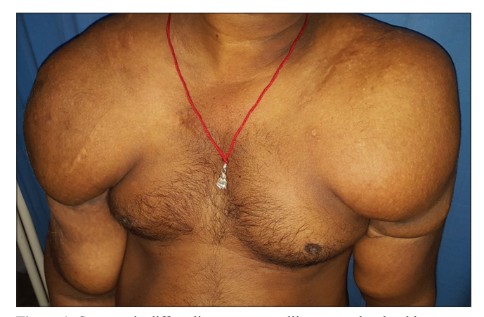
Figure 1: Symmetric diffuse lipomatous swellings over the shoulders, arms and upper trunk

Madelung's disease, first reported in 1846 by Brodie, was called 'fat neck' (Fetthals) by Madelung. In 1888, Otto Madelung reported the