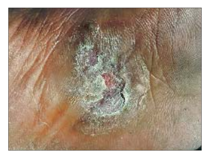
Figure 5: Hyperkeratotic, eczematoid lesion of cutaneous leishmaniasis over plantar aspect of foot