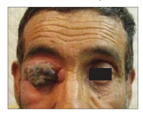
Figure 4: Hyperkeratotic plaque over upper eyelid, causing mechanical ptosis

zosteriform and erysipeloid) and more recently by Shams et al ,<sup>[7]</sup> (paronychial, annular, eyelid, chancriform, zosteriform, palmoplantar, DLE-like and eczematous CL). Both of these studies were done in Baluchistan, while all of our patients belonged to central and northern Punjab and the northern