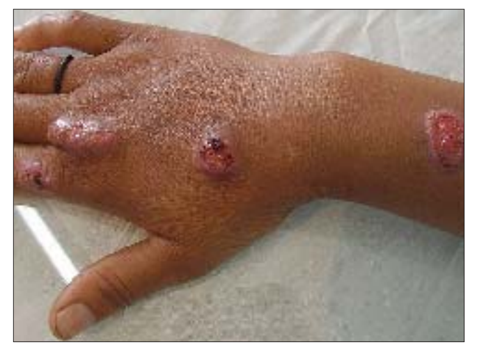
Figure 2: Sporotrichoid pattern over dorsum of hand and forearm