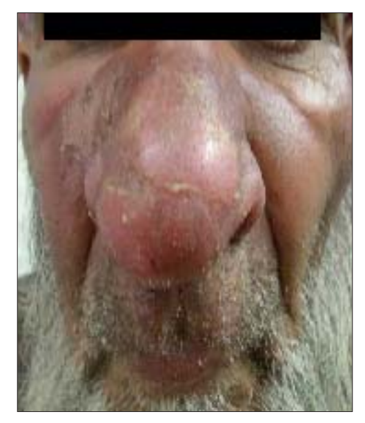
Figure 1: Lupoid lesion involving nose and central part of the face