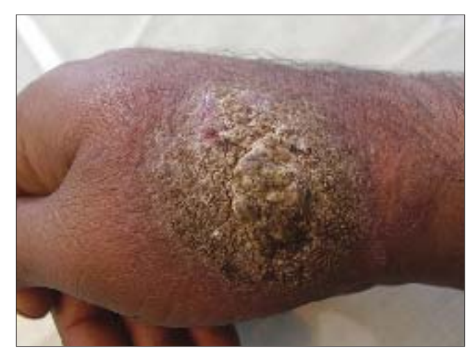
Figure 6: Verruciform and heaped-up plaque over the dorsum of hand