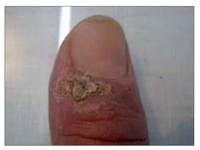
Figure 3: Paronychial lesion of cutaneous leishmaniasis

zosteriform and erysipeloid) and more recently by Shams et al ,<sup>[7]</sup> (paronychial, annular, eyelid, chancriform, zosteriform, palmoplantar, DLE-like and eczematous CL). Both of these studies were done in Baluchistan, while all of our patients belonged to central and northern Punjab and the northern