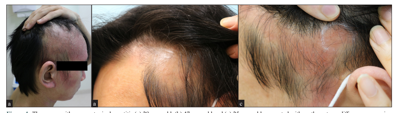
Figure 1: Three men with severe atopic dermatitis (a) 28-year old, (b) 47-year old and (c) 25-year old, presented with erythematous, diffuse, non-scarring alopecic patches on the frontal and parietal scalp following the use of dupilumab.

Multiple case reports and clinical studies suggest that dupilumab may act as a novel remedy for AA. It has been proposed that dupilumab could treat Th2-associated inflammation in the hair follicles and promote hair growth. Nonetheless, there are multiple reports of patients developing alopecic patches while on dupilumab. These differences in