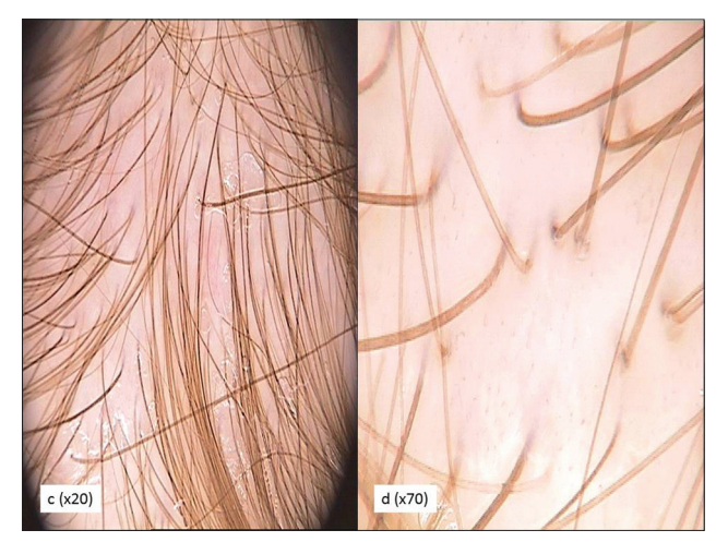
Figure 2: Telogen effluvium. Trichoscopy of the frontal area of the scalp (c: 20-fold and d: 70-fold). Thin- and medium-sized hairs, single-hair and double-hair units

and 54% for TE. Specificity achieved lower values: 34% for FAGA and 62% for TE. Trichoscopy can also precise the diagnosis of coexistence of FAGA and TE. Presented data proved that the trichoscopy is characterized by high sensitivity and specificity in the diagnosis of FAGA and TE and could be consider as a reference test for the diagnostic purposes.