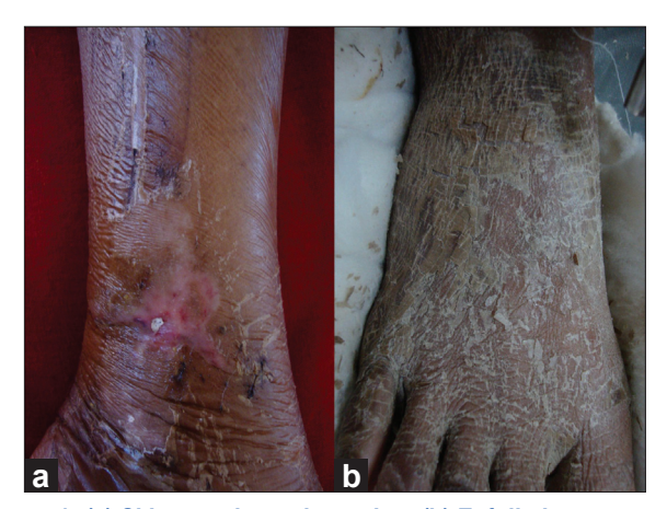
Figure 1: (a) Skin atrophy and scarring. (b) Exfoliation

however, no study subject showed any features. Such reaction can be detected early by regular examination of the skin at the proximal and distal margin of the plaster where all components of the materials used are in repeated direct contact with the skin. Newer fibercast products offer advantages in terms of lightness and water resistance, but cutaneous outcomes are unlikely to differ. Further study of pathological skin changes under the stress of plaster immobilization and innovative counter measures to such changes without compromise to the fracture immobilization may be considered.