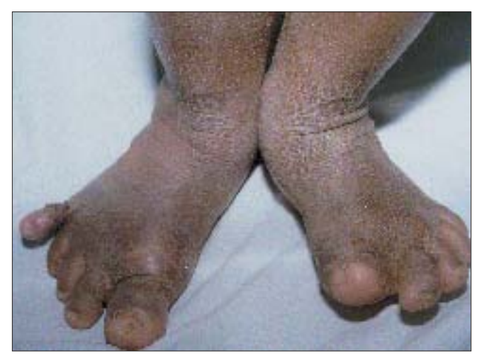
Figure 2: Constricting fibrous bands over right great toe and fifth toe with loss of left great toe

Along with the features of Vohwinkel's syndrome, our patient had generalized ichthyosis, which is similar to the previous case reports of Camisa variant of Vohwinkel's syndrome. [1,4] The other clinical variant of Vohwinkel's syndrome is associated with deafness but no ichthyosis. [3] However, audiogram