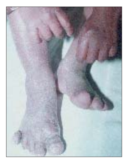
Figure 1: Linear keratosis over dorsum of hands associated with ichthyosis

Camisa disease is a rare variant of Vohwinkel's syndrome associated with generalized ichthyosis and without deafness. [1.2] On the basis of recent molecular studies, it is now clear that Vohwinkel's syndrome associated with ichthyosis is caused by mutations in loricrin gene. [3-5] However, a variant of Vohwinkel's syndrome which had all the classical clinical features of Vohwinkel's syndrome but lacking atypical associations like ichthyosis and sensorineural deafness with negative gene mapping for loricrin mutation has been reported recently. [6]