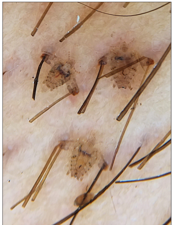
Figure 2: Dermoscopy showing three crab lice holding on to hair shafts in the axilla as if in the process of skiing (DermLite D4 dermoscope, polarising mode, magnification 10×)

How to cite this article: Vasudevan B, Vendhan DS, Neema S. Crabs skiing in the axilla. Indian J Dermatol Venereol Leprol doi: 10.25259/IJDVL_166_2023