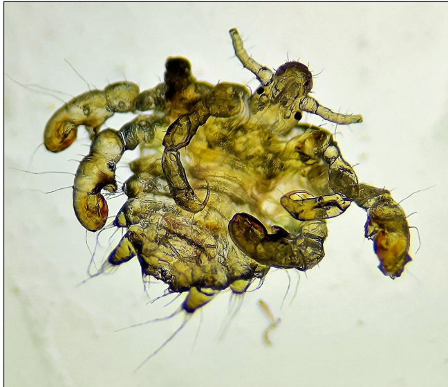
Figure 3: Microscopy (10×) showing Pthirus pubis (crab louse) with characteristic morphological features

The authors certify that they have obtained all appropriate patient consent.