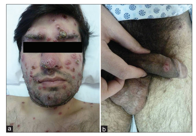
Figure 1: (a) Symmetrically distributed ulcerated nodules and plaques, covered with thick adherent crusts. (b) Indurated ulcer on penis

Syphilis is a chronic, systemic infection that progresses through clinically manifest and latent stages. [1] Although, most patients co-infected with HIV and