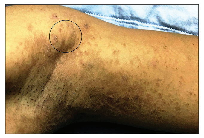
Figure 1: Erythematous papules involving the left axilla with fine adherent scaling

A 16-year-old female presented with slightly erythematous scaly papules involving both the axillae since the past 3 months. The lesions were episodically pruritic precipitated by sweating on exertion or warm weather. In addition, she had similar lesions involving both the cubital fossae and groins. There was no personal or family history of atopy. The lesions were predominantly discrete papules but had coalesced at places to form plaques with fine scaling [Figure 1, black circle]. The