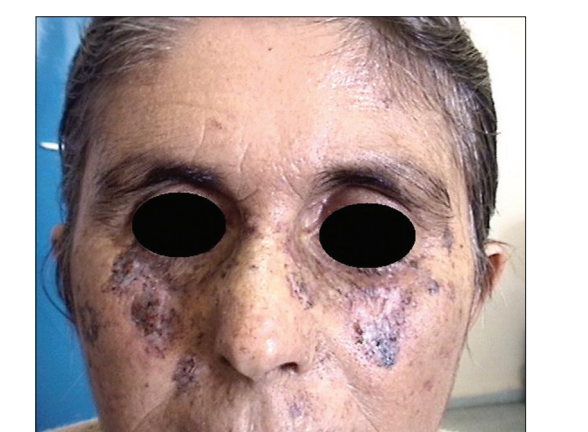
Figure 1a: Multiple, facial basal cell carcinomas before treatment

Renal transplantation is known to be associated with an increased incidence of non-melanoma skin cancers possibly related to use of immunosuppressant drugs. Both squamous cell carcinoma and BCC, the two major histological types of non-melanoma skin cancers, exhibit a more aggressive biological and clinical course in renal transplant recipients, with higher rates of recurrence and mortality than the general population.<sup>[3]</sup> The incidence of BCC in the general white population is between 18% and 40%<sup>[4]</sup> while a study in The Netherlands, revealed that the incidence of BCC in transplant recipients was 10 times higher than the general population.<sup>[5]</sup>