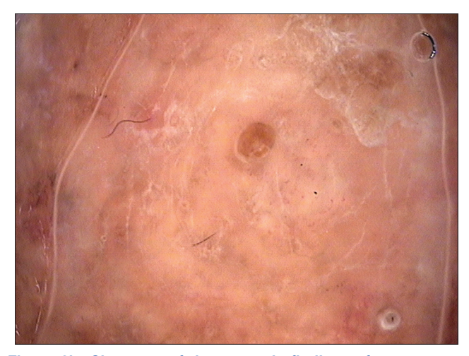
Figure 3b: Clearance of dermoscopic findings after treatment with imiquimod

End stage renal disease is also a cause of immunosuppression in itself as both T and B-cell functions are reported to be altered possibly due to the uremic state.<sup>[6,7]</sup> Though there is an increased prevalence