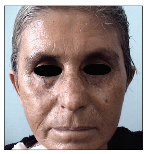
Figure 3a: Significant clearance after treatment with imiquimod