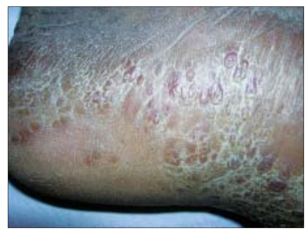
Figure 2: Multiple erythematous papules over the left sole

Ultrasonography of the abdomen demonstrated diffuse hypoechoic liver (probably due to druginduced hepatitis) with paraaortic and mesenteric lymphadenopathy. According to NACO guidelines, Highly active antiretroviral therapy (HAART) was not started as the patient was on antituberculous therapy. One and half month later, he was readmitted with complaints of dyspnea and recurrent attacks of hemoptysis. Computed tomography (CT) scan of the chest revealed a single large necrotic cavitatory lesion in the right apical region but no evidence of pulmonary involvement by KS. Repeat sputum AFB was positive after five months of antituberculous therapy, therefore category II antituberculous therapy was started along with HAART.