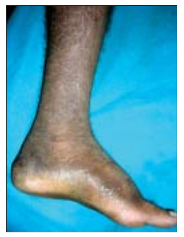
Figure 1: Multiple hyperpigmented to brown-colored papules coalescing to form plaques on the left lower limb

Kharkar, et al. Kaposi's Sarcoma in India