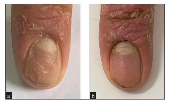
Figure 3: Right index psoriatic nail of a 42 years old male (a) Crumbling before treatment with Intense pulsed light (IPL) clinically. (b) Improvement three months after the last session clinically.

*: Statistically significant at p ≤ 0.05