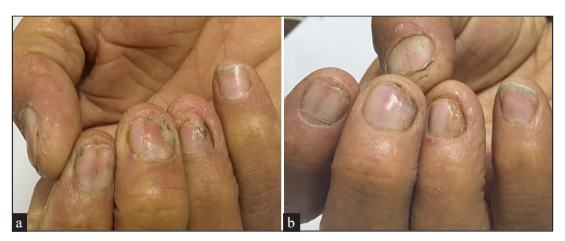
Figure 1: Right hand psoriatic nails. (a) Before treatment with Intense pulsed light (IPL). (b) Mild Intense pulsed light improvement three months after last right hand psoriatic nails of a 50 years old male.

With both PDL and IPL, there was no significant difference between the median decrease of the nail bed and the nail matrix NAPSI [Figure 2].