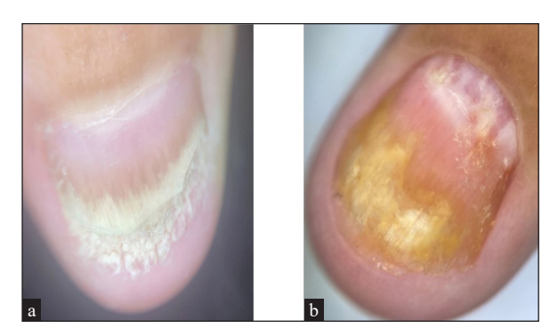
Figure 5: Dry onychoscopy (10x) of psoriatic fingernails. (a) Oil drop, distal onycholysis and subungual hyperkeratosis. (b) Distal onycholysis, oil drops and red spots in lunula.

between PDL (5.0 \pm 2.29) and IPL (4.60 \pm 2.76) treated groups (P = 0.621) after sessions. Patient satisfaction was nearly equal in both laser-treated groups (P = 0.587). The majority of cases (60%) were satisfied with the improvement. Five patients (25%) were extremely satisfied with PDL, seven patients (35%) had the same impression with IPL, and three patients (15%) reported fair satisfaction with PDL and only one patient (5%) with IPL.