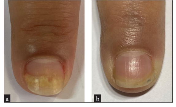
Figure 4: Right index psoriatic nail. Right index psoriatic nail of a 23 years old female (a) Onycholysis before treatment with Pulse dye laser (PDL) clinically. (b) Improvement of onycholysis three months after last session clinically.