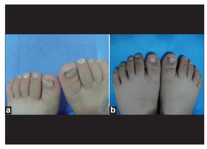
Figure 1: Before treatment: (a) First to third toenails on the left foot and first to second toenails on the right foot with many white patches on the surface of the toenails. Besides, erythema and mild exfoliation on the toes around nails. After 3 months of treatment: (b) All toenails were normal

The patient was treated with 1% Bifonazole cream on each affected nail, 2 times a day, for 3 months. After 30 days of treatment, marked improvement was seen in all the 5 nails and the skin around the nails. No side-effects of the administered drug were seen. All toenails also showed almost complete clinical and mycological cure after 3 months of therapy [Figure 1].