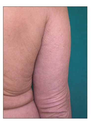
Figure 3: Retroauricular mucinous papules