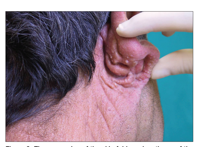
Figure 2: The coarsening of the skin folds and erythema of the right arm skin