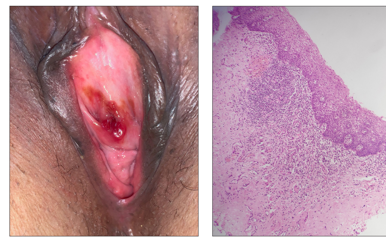
Figure 1a: Bright red erythematous shiny patch over periurethral area

Plasma cell vulvitis, also known as Zoon's vulvitis, is an extremely rare vulval dermatoses presenting as solitary asymptomatic or pruritic sharply defined erythematous shiny plaque with 'lacquer paint' appearance.<sup>1</sup> Common differentials include desquamative inflammatory vaginitis and erosive lichen planus. Desquamative inflammatory vaginitis presents clinically with white-yellow discharge and vaginal erythema in a confluent or petechial pattern along with the presence of papillary lymphocyte-predominant infiltrate.<sup>2</sup> We wish to emphasise the classical presentation of a rare dermatoses through this case report and the need to differentiate it from other similar entities.