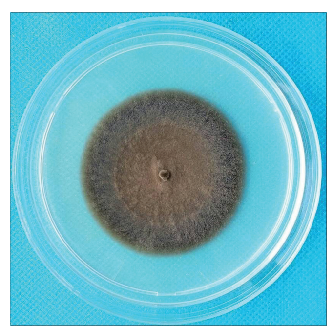
Figure 2b: A pure culture of the colonies (Sabouraud glucose agar, 28°C, 2 weeks)

forms.<sup>1</sup> The initial diagnosis in our clinic was sporotrichosis as well, since the epidemiology and clinical manifestation were more consistent with sporotrichosis instead of other diseases and the case history showed that oral solution of potassium iodide (20 ml/day) was effective. Considering that the skin biopsy had been performed, the patient was directly started on antifungal treatment without another biopsy. However, it was confirmed by subsequent mycological examination that chromoblastomycosis was the right diagnosis.