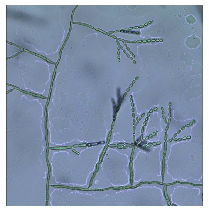
Figure 2c: The microscopy of the slide culture showing conidiophores bearing outwardly spreading, sparsely branching, long acropetal chains of ellipsoidal, smooth-walled, symmetrical, one-celled conidia (potato dextrose agar, 28°C, 10 days) (×400)