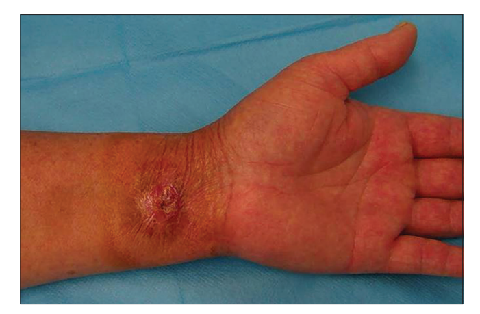
Figure 3a: Lesion on the patient's left wrist after 4-week treatment