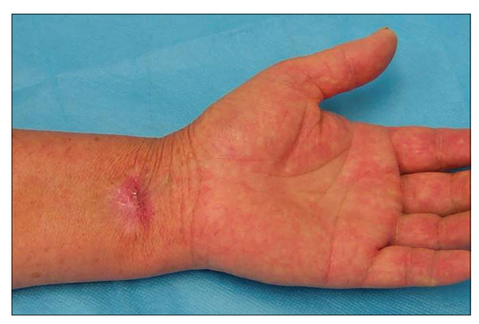
Figure 4a: Lesion on the patient's left wrist after 16-week treatment

In conclusion, we describe an atypical case of chromoblastomycosis caused by C. carrionii which is a mimic of sporotrichosis. Mycological examination, instead of simple skin biopsy or clinical manifestation, is the gold standard for the diagnosis. Dermoscopy can be an effective and noninvasive method to indicate the diagnosis of chromoblastomycosis based on the presentation of irregular blackish-red dots. In the present case, treatment combining oral terbinafine, topical naftifine-ketoconazole cream and thermotherapy was found to be the best choice.