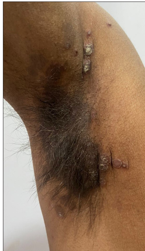
Figure 2: Well-defined hyperpigmented to erythematous plaques on axilla